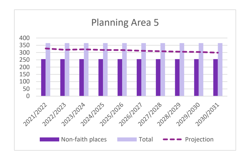
Graph 5 . Forecast shown against total available places and non-denominational places in Planning Area 5