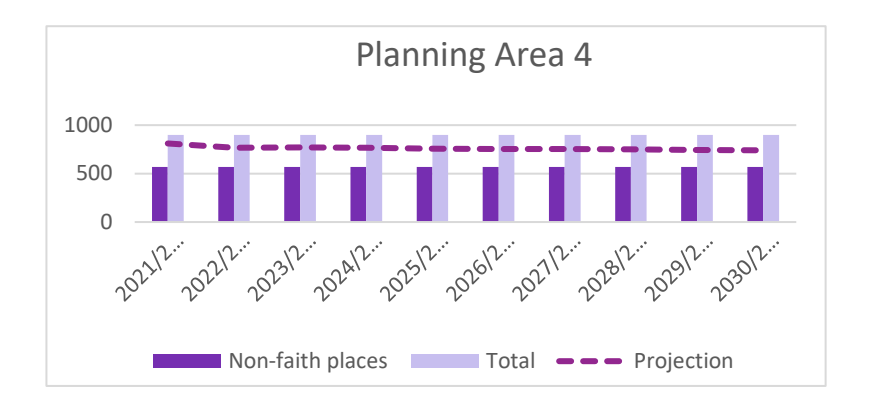
Graph 4 . Forecast shown against total available places and non-denominational places in Planning Area 4

7.18 Planning Area 5, Underhill & High Barnet : The updated GLA projections indicate that there is sufficient provision in this area. This is another area with pockets of localised pressure that the Council has been monitoring since 2017. Although there is still some pressure, there has been no need for additional provision. The small surplus anticipated over the next five years is well below the 5% margin and the need for a larger surplus to manage in-year demand is evident through the in-year pressure experienced in this planning area. Again, GLA projections will be kept under review and if required, additional provision will be commissioned through bulge classes in existing schools.