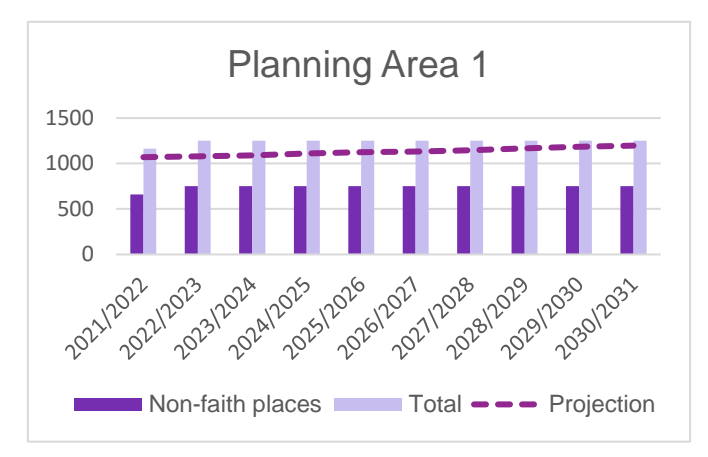
Graph 1 . Forecast shown against total available places and non-denominational places in Planning Area 1