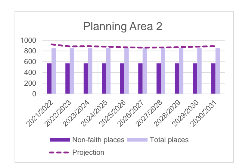
Table 4: Updated Reception forecast in Planning Area 2