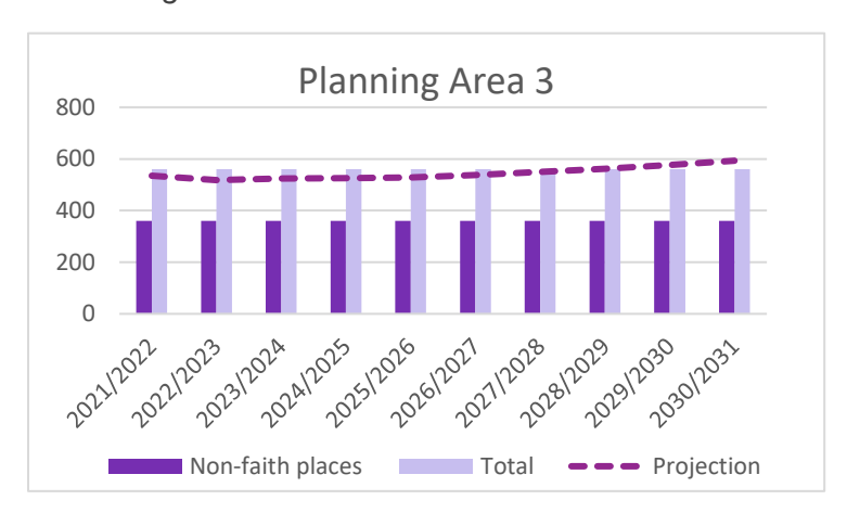
Graph 3 . Forecast shown against total available places and non-denominational places in Planning Area 3

7.17 Planning Area 4, Coppetts, West Finchley, Woodhouse, East Finchley & Finchley Church End: Additional places provided in this planning area through the expansion of Martin and Moss Hall, and new provision added by Alma and Wren Academy primary schools, has created sufficiency to meet the anticipated demand in this area for the next five years. Since 2017, no additional provision has been required through bulge classes and the previous localised pressure felt in this planning area has not been experienced in the last three years. The anticipated surplus is below the 5% margin and will help to accommodate in-year demand.