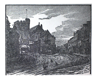
BARNET HIGH STREET BEFORE THE DEMOLITION OF "MIDDLE ROW."