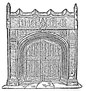
DOORWAY OF ANCIENT HALL, QUEEN ELIZABETH'S GRAMMAR SCHOOL, BARNET.