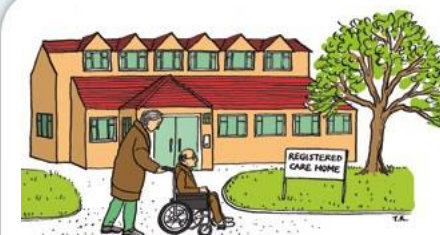
In a care home