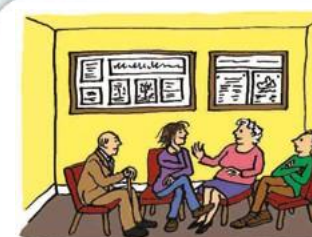
At a club