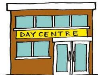
At a day centre or college