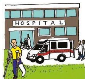
In a hospital