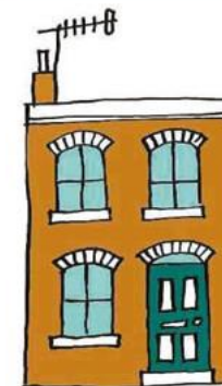
In a house