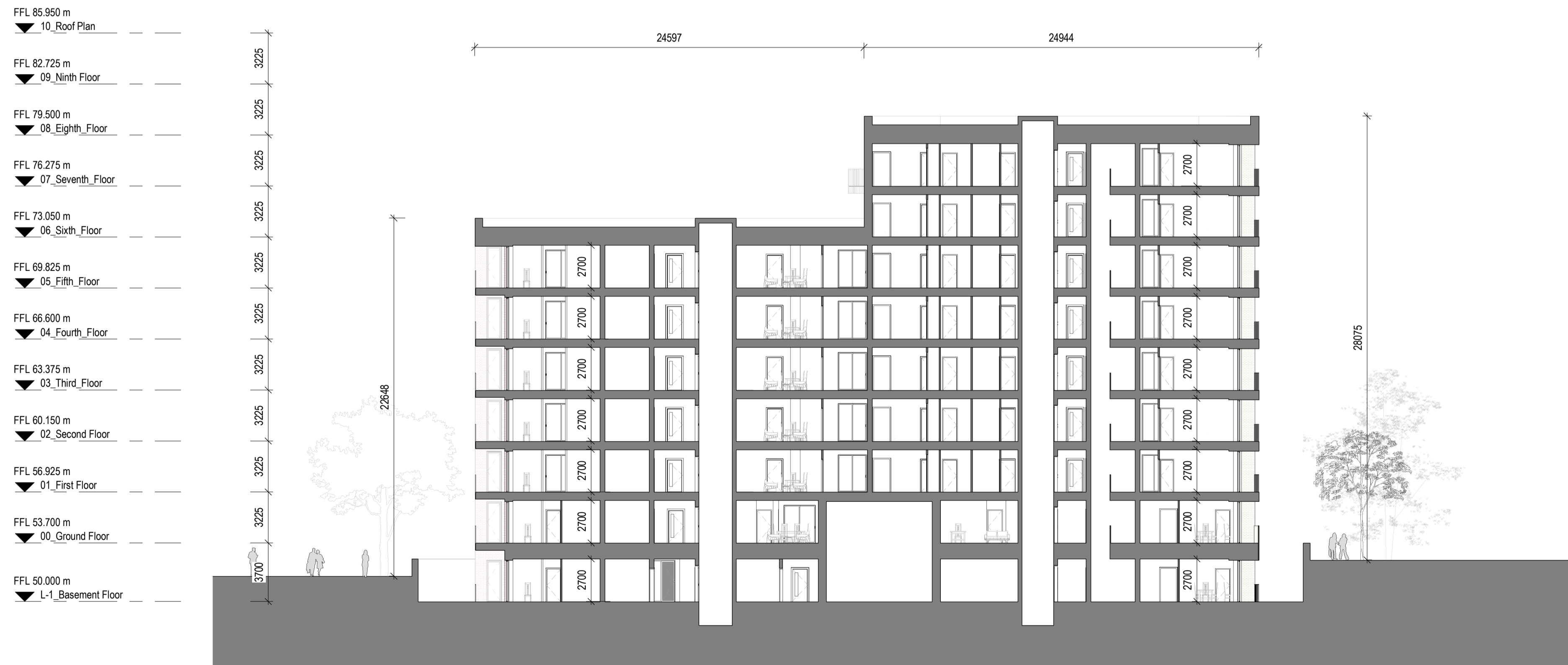
B Block 1C_Cross Section B 1 : 200