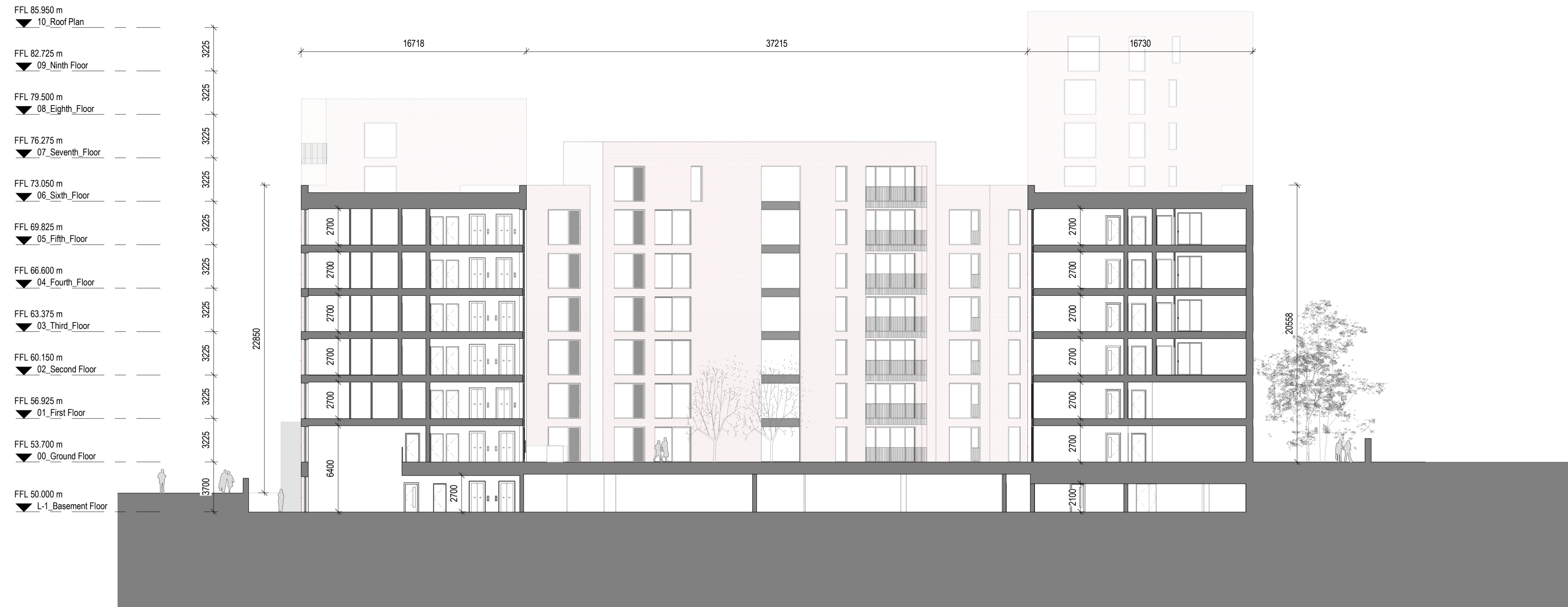
A Block 1C_Cross Section A 1 : 200