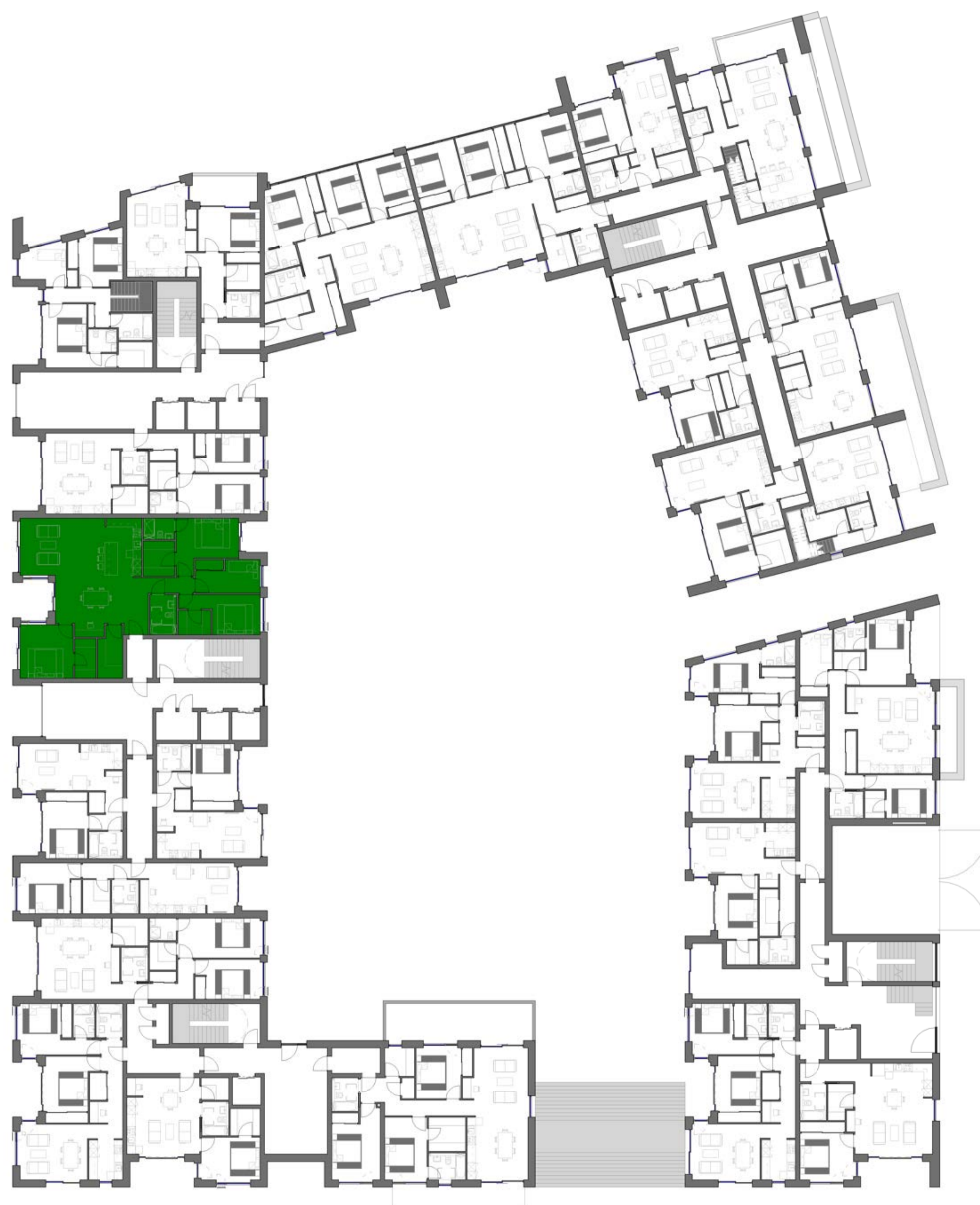
Block D_4 Bedroom Apartment Type 01 1 : 50 Size: 147.3m 2 Total Apartments: 1