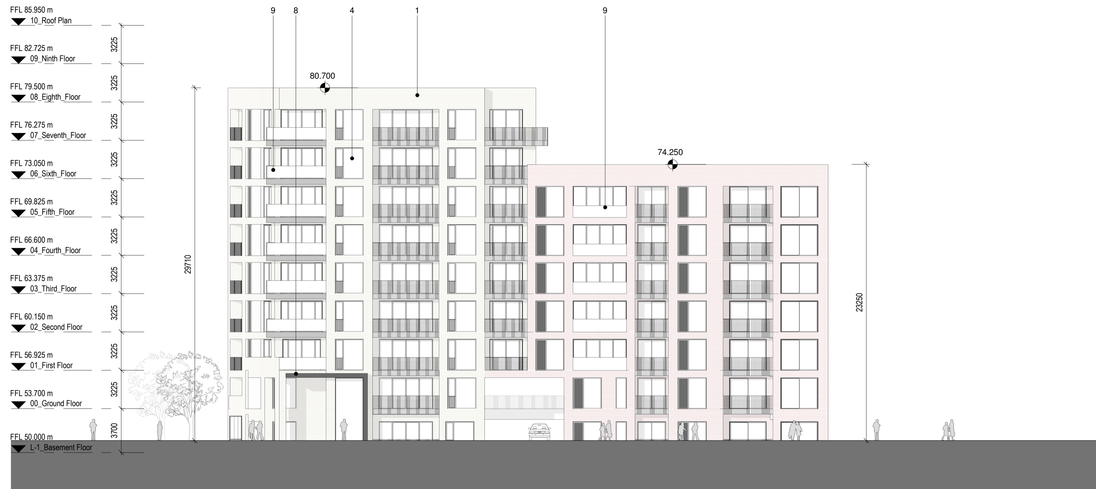
1 Block 1C_South Elevation 1 : 200