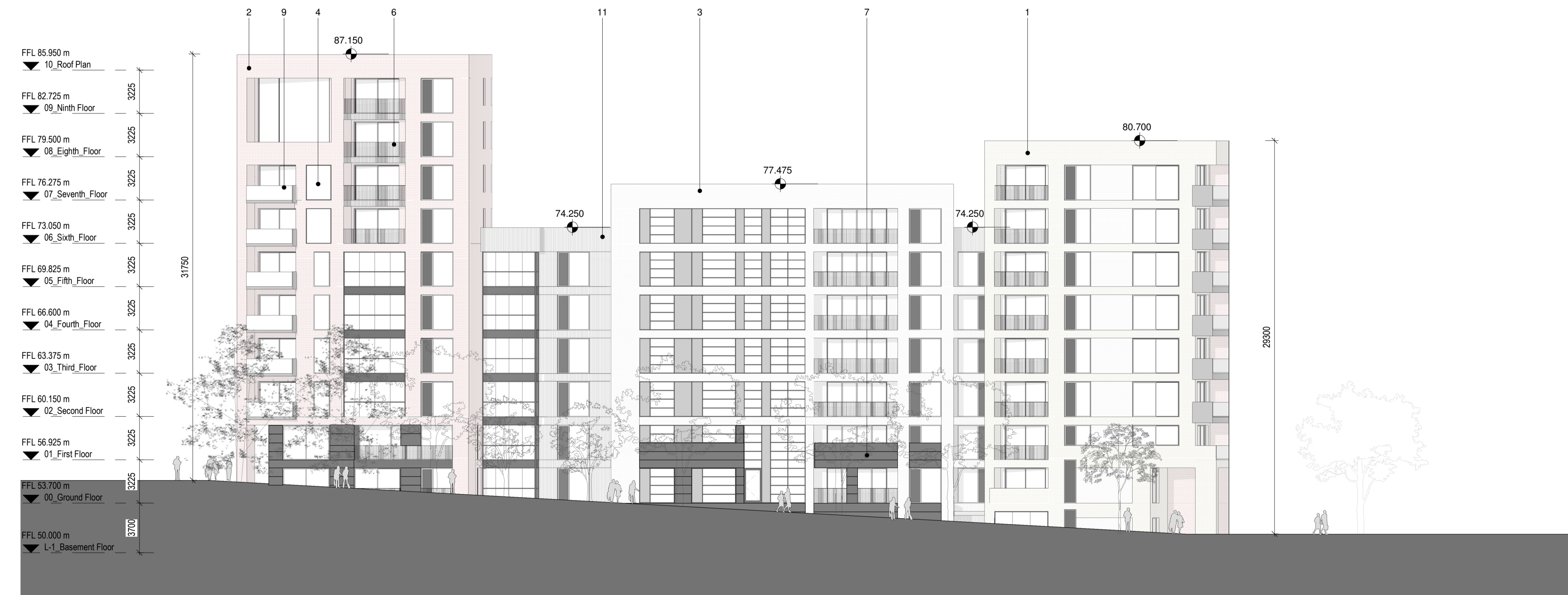
2 Block 1C_West Elevation 1 : 200