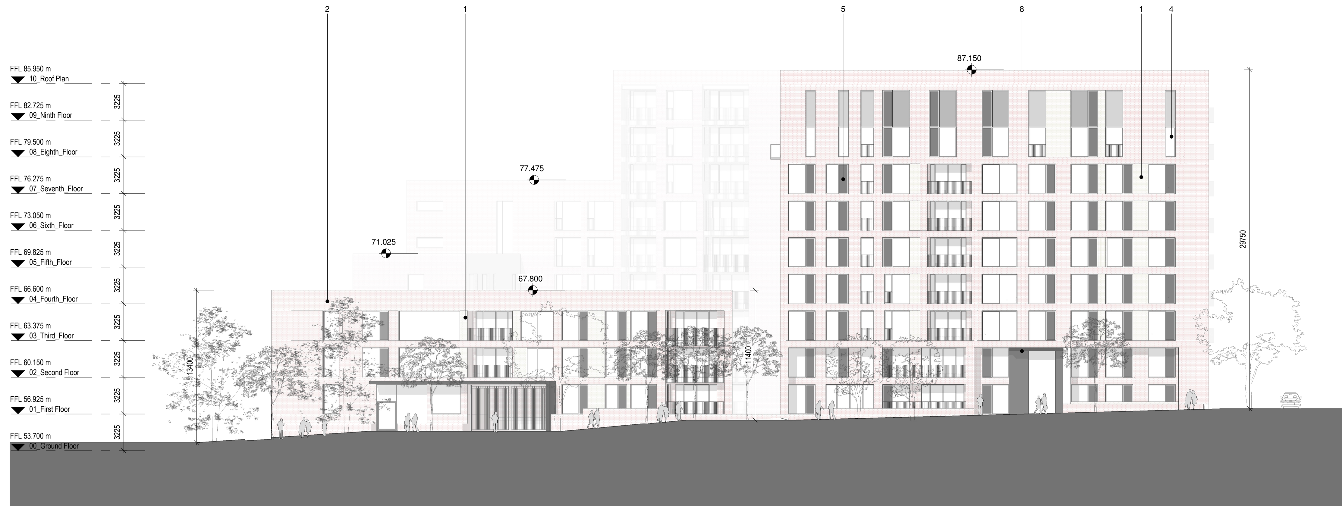
1 Block 1D_North Elevation 1 : 200