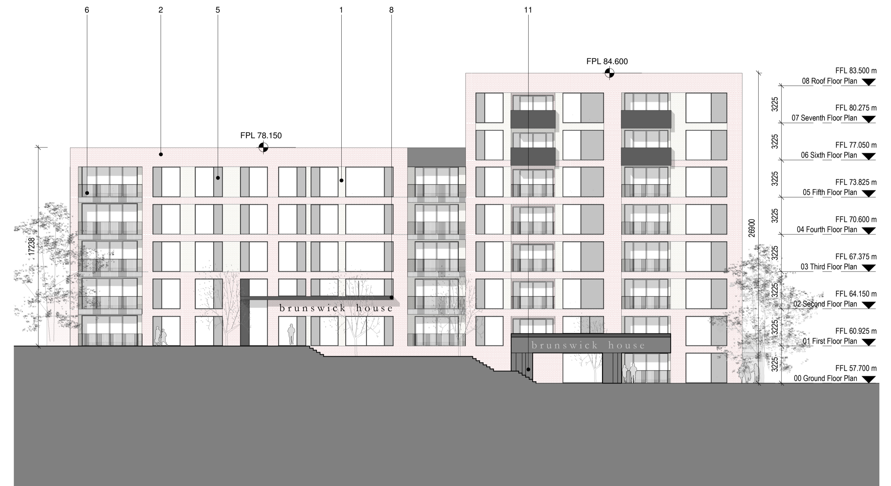
1 Block 1F_South Elevation 1 : 200