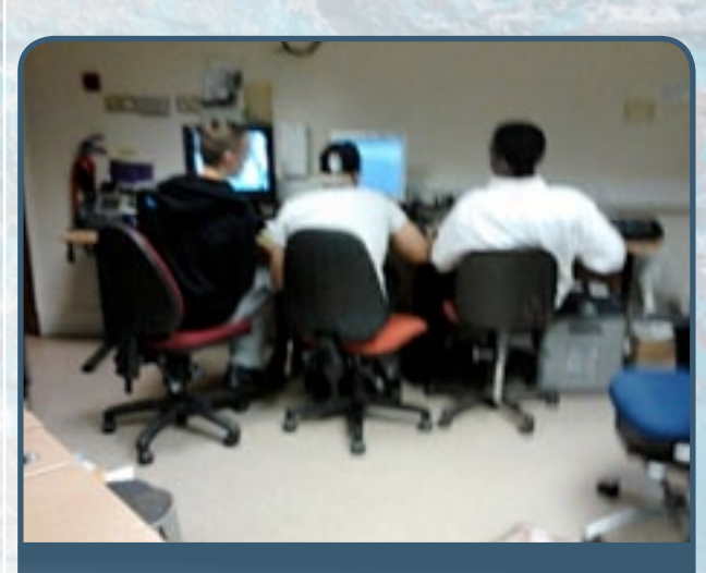
Using the computer to list books