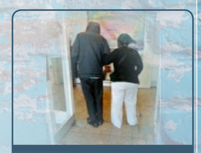
Escorting service users into the centre