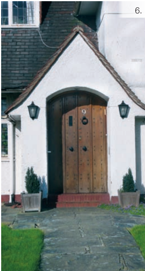
6. Meadway Nos. 7-21 and 12-16, 19 Heathgate Nos. 7 - 13 are a group of four Bunney and Makins houses with the central semi-detached pair set back between two end houses with broad projecting gables which enclose the group. They are remarkable for the use of a rustic, cottage style for what are actually, quite large houses (Photograph 6). The articulated building line emphasises the effect of the down swept roofs, the flat roofed dormers and the horizontal window lines. These are rendered, all are now white, in contrast to the group opposite, also by Bunney and Makins, which have decorative herring-bone brickwork.

There is a very abrupt change in character at No. 15 which marks the start of a block of five Neo-Georgian terraced houses by Sutcliffe (Photograph 7 - see overleaf). The contrast between the formality of these houses and the picturesque Arts and Crafts style of the adjacent Bunney and Makins houses is startling. However, street trees, wide paths, grass verges and the openness of the road, make the contrast visually exciting rather than overpowering.