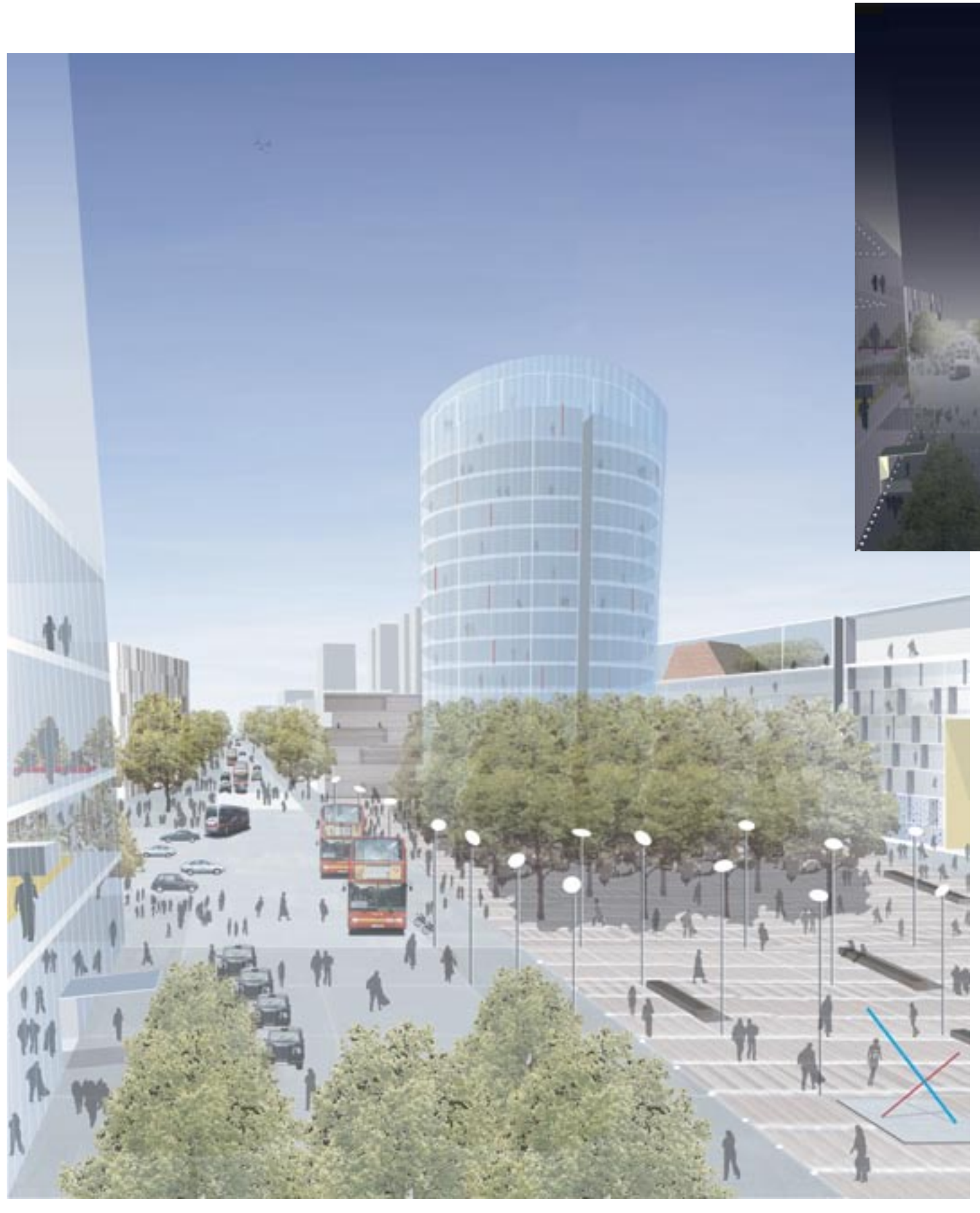
Figure 4: The commercial district