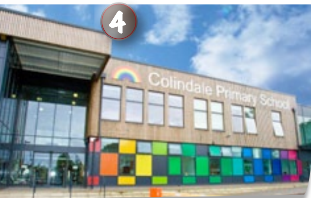
Colindale, the borough's newest primary school building: opened in spring 2012

Barnet's school community is as varied as its population. Among the new schools entering the 'mix' are: Sacks Morasha Primary, a Jewish school entering the voluntary-aided sector in April 2013, Alma Primary, a new Jewish free school, St Mary's and St John's, Barnet's first all-through school spanning nursery to sixth-form, Archer Academy, the borough's first non-denominational, co-educational secondary free school, and St Andrew the Apostle Greek Orthodox Free School, Britain's first Greek Orthodox secondary school.