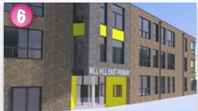
Mill Hill East Primary school: will open in 2014, supporting new homes in the area