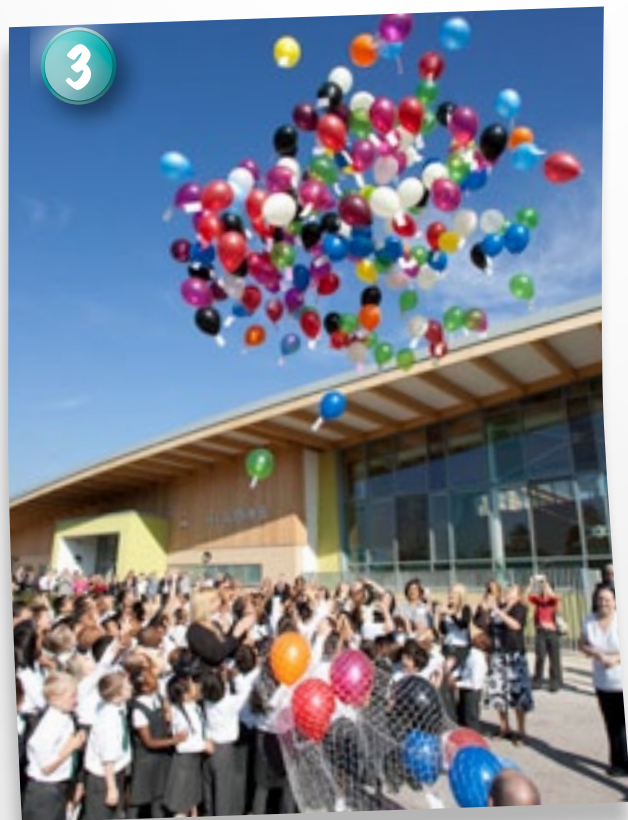
Northway Special School and Fairway Primary School: opened in autumn 2011