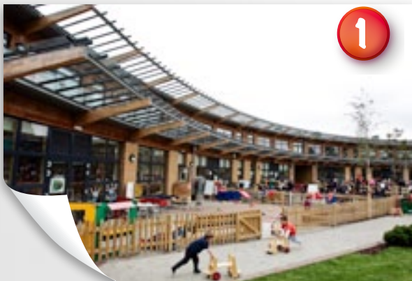
Broadfields: opened in autumn 2010

This new £12.3 million three-form entry school will offer enhanced sports facilities including a full size all weather football pitch for community use. It is being mainly funded by the wider development in the area and will open its doors to its first intake of pupils in 2014.