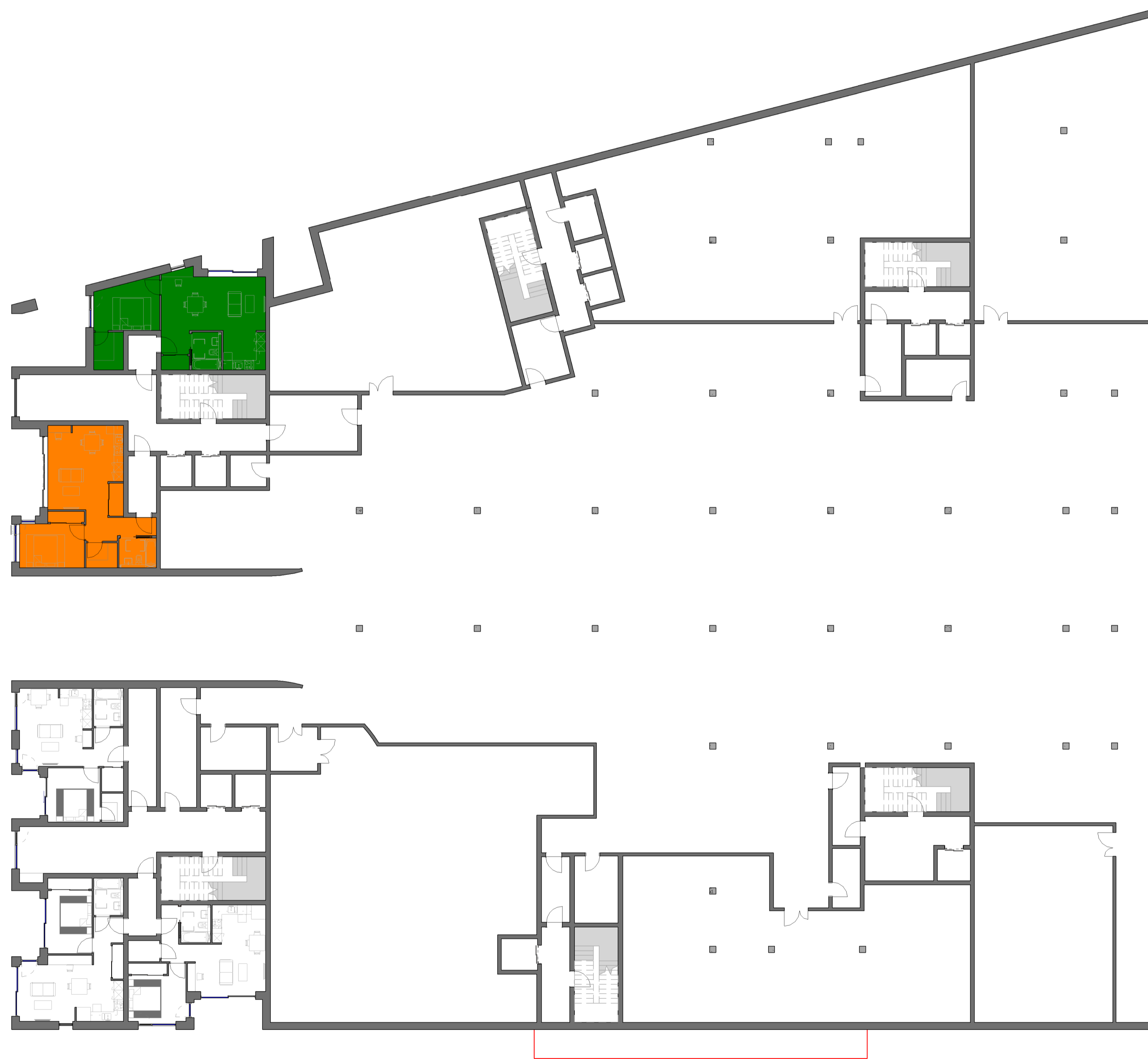
4 Block C_1 Bedroom Apartment Key Plan_Type 01 & 02 1 : 200