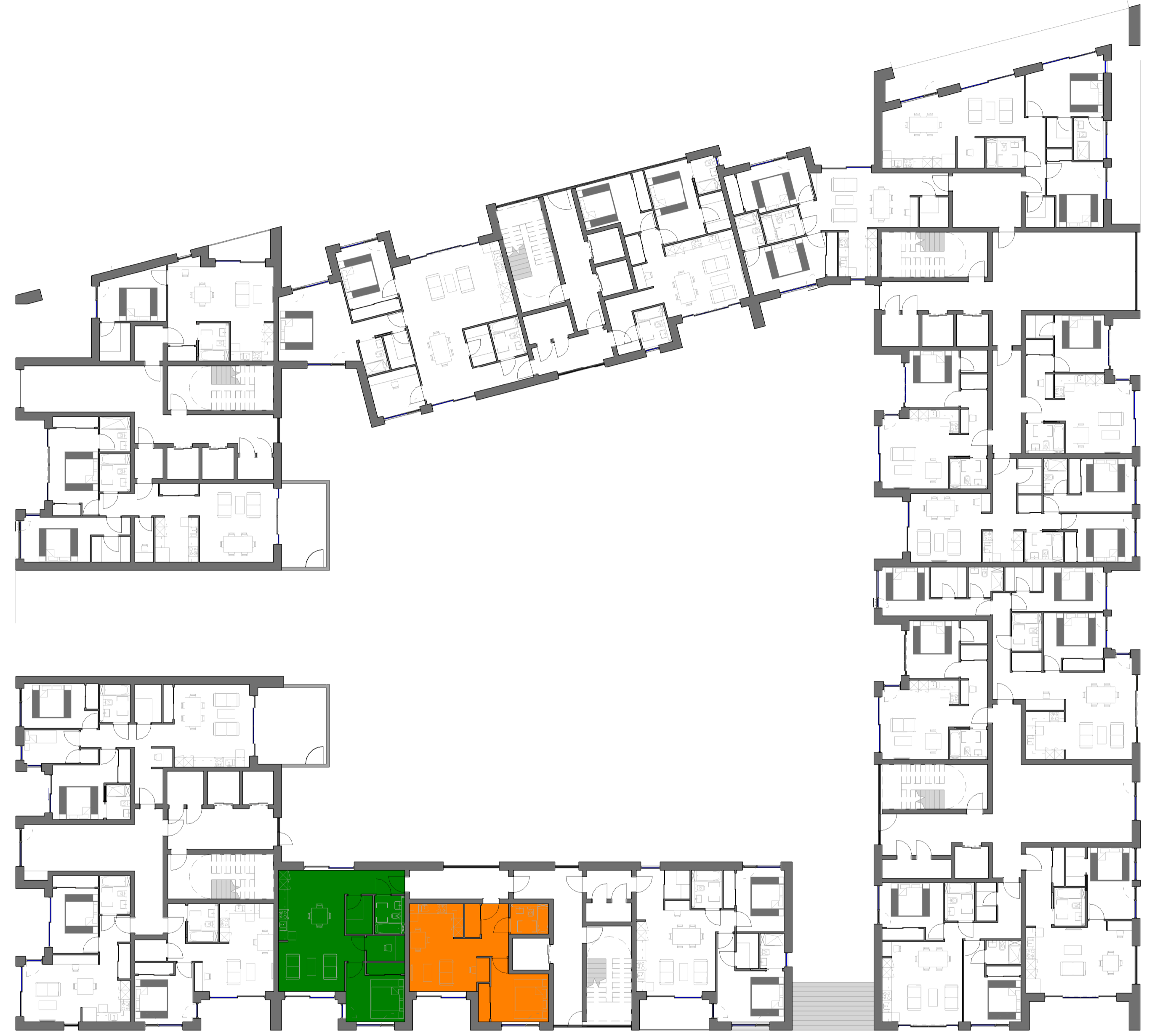
3 Block C_1 Bedroom Apartment Key Plan_Type 06 & 07 1 : 200