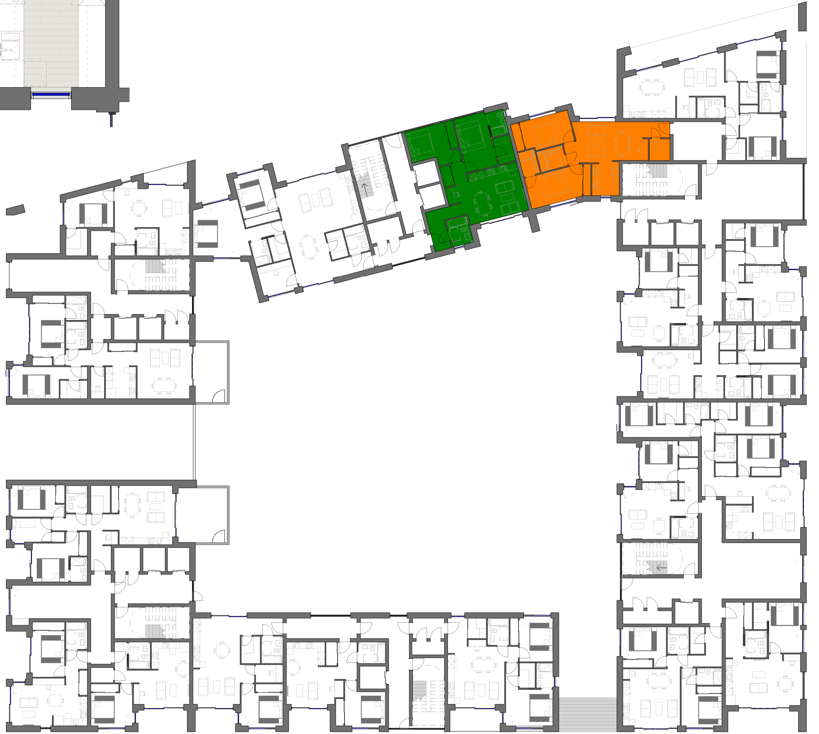
3 Block C_2 Bedroom Apartment Key Plan_Type 03 & 04 1 : 200