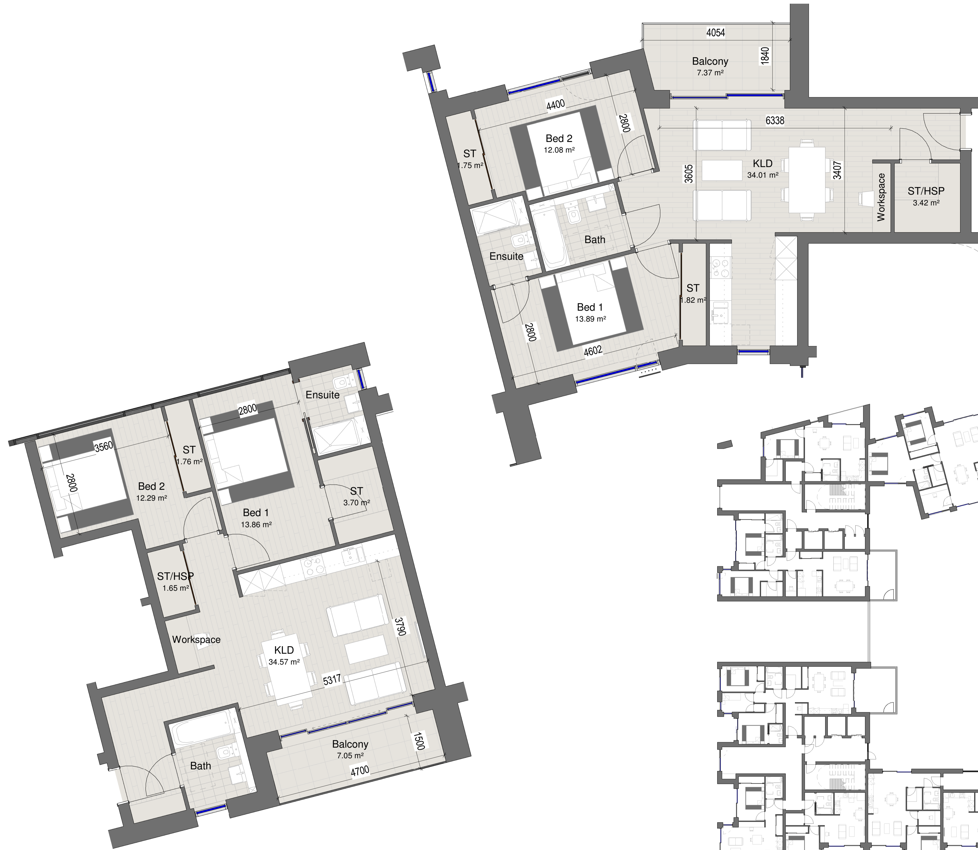
2 Block C_2 Bedroom Apartment Type 04 1 : 50 Size: 77.7m 2 Total Apartments: 6