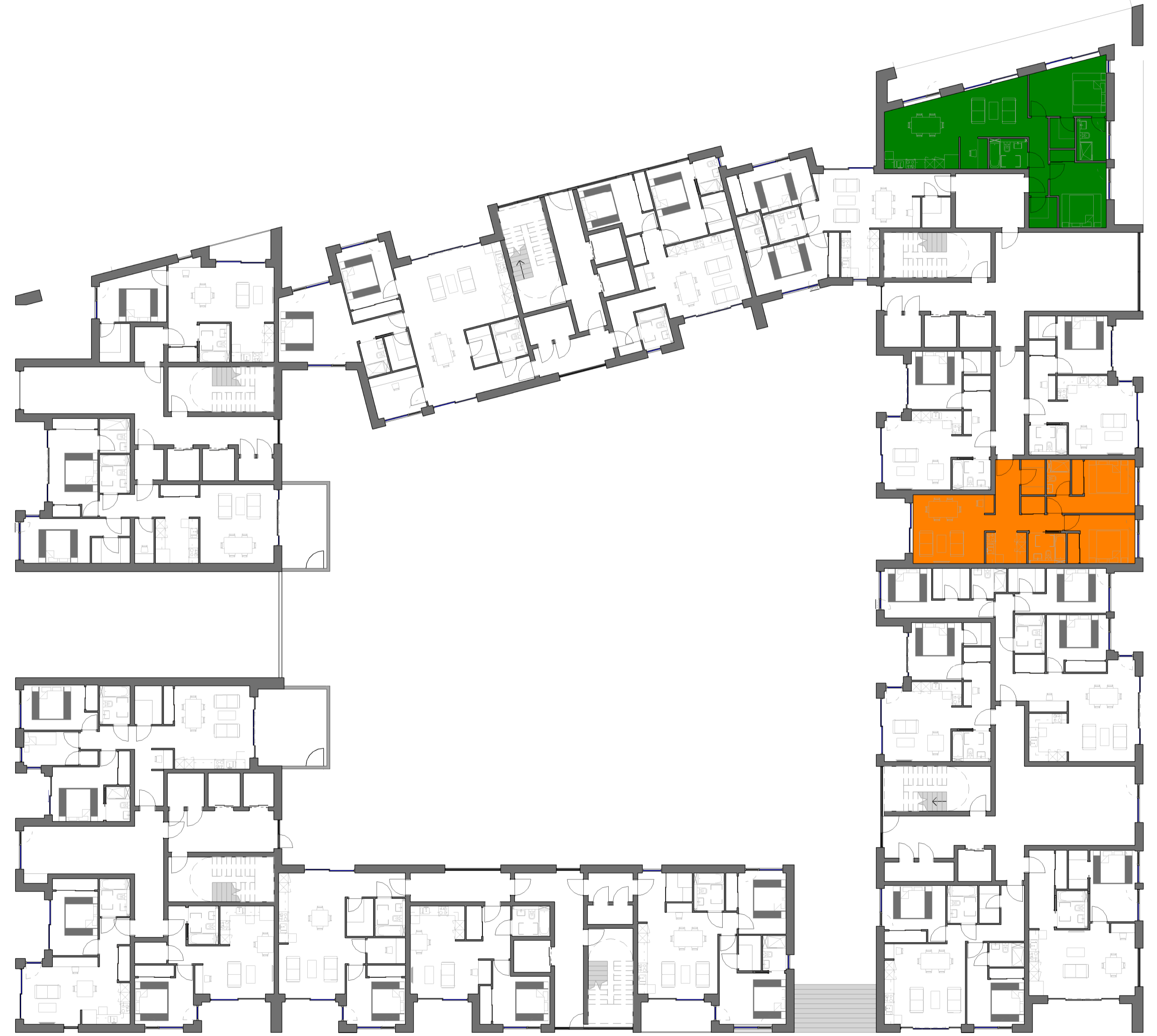
3 Block C_2 Bedroom Apartment Key Plan_Type 05 & 06 1 : 200