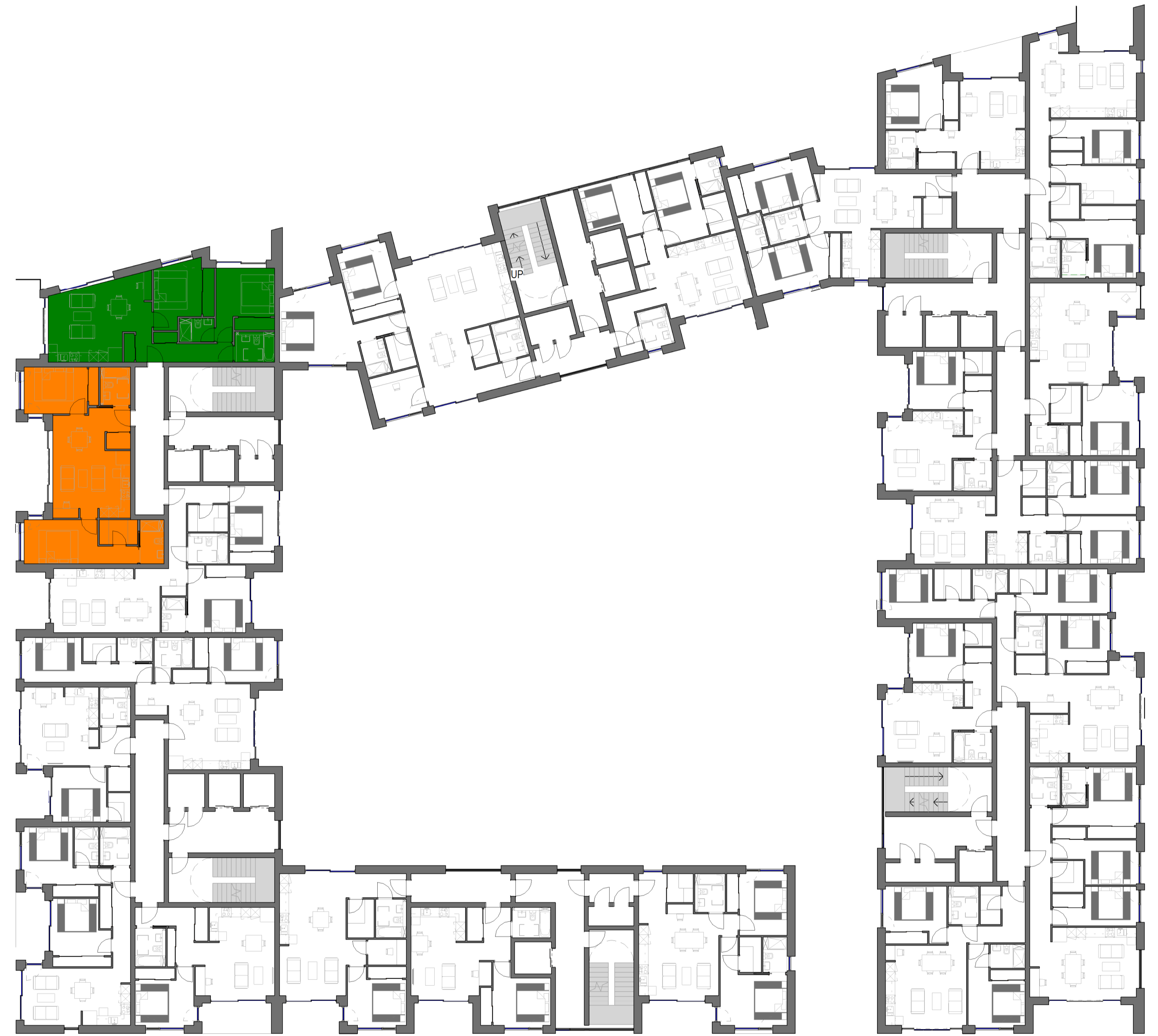
3 Block C_2 Bed Apartment Key Plan_Type 09 & 10 1 : 200