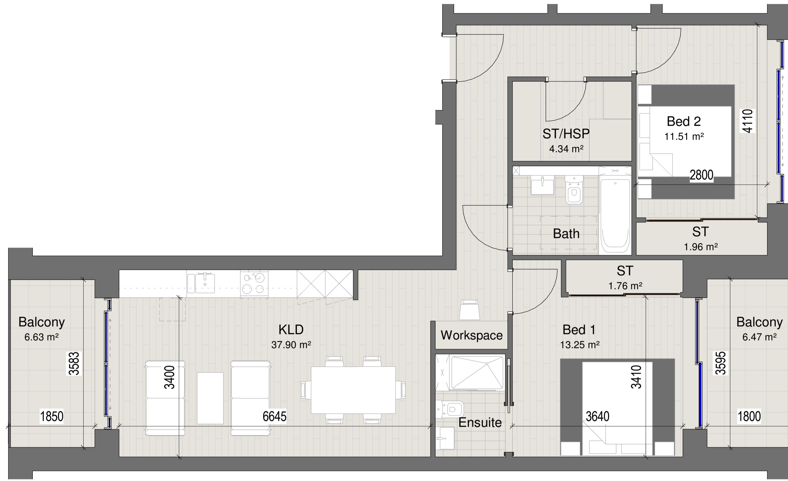
1 Block C_2 Bed Apartment Type 11 1 : 50 Size: 82.3m 2 Total Apartments: 7