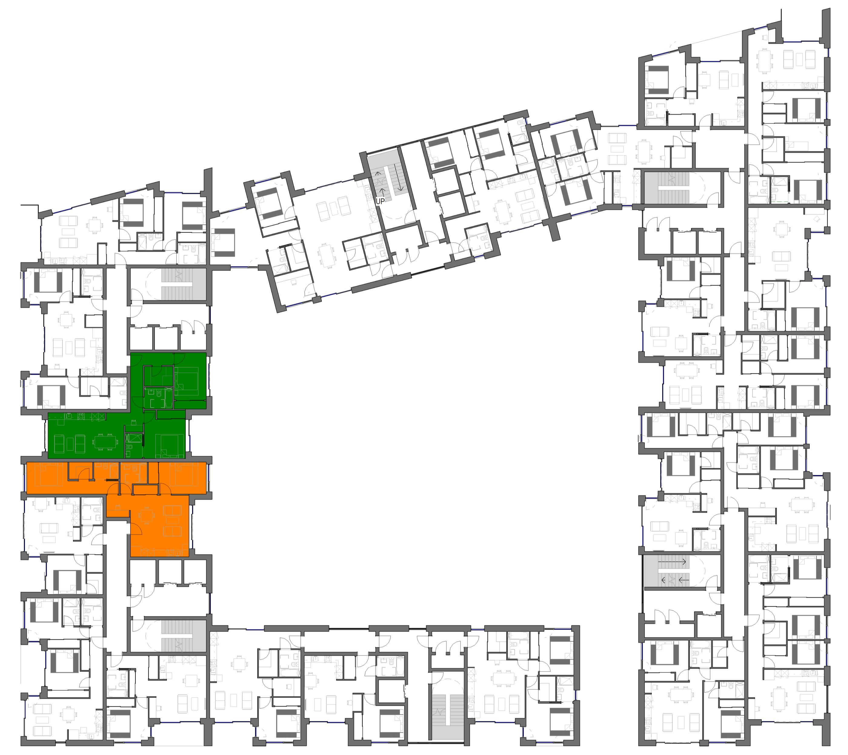
3 Block C_2 Bed Apartment Key Plan_Type 11 & 12 1 : 200