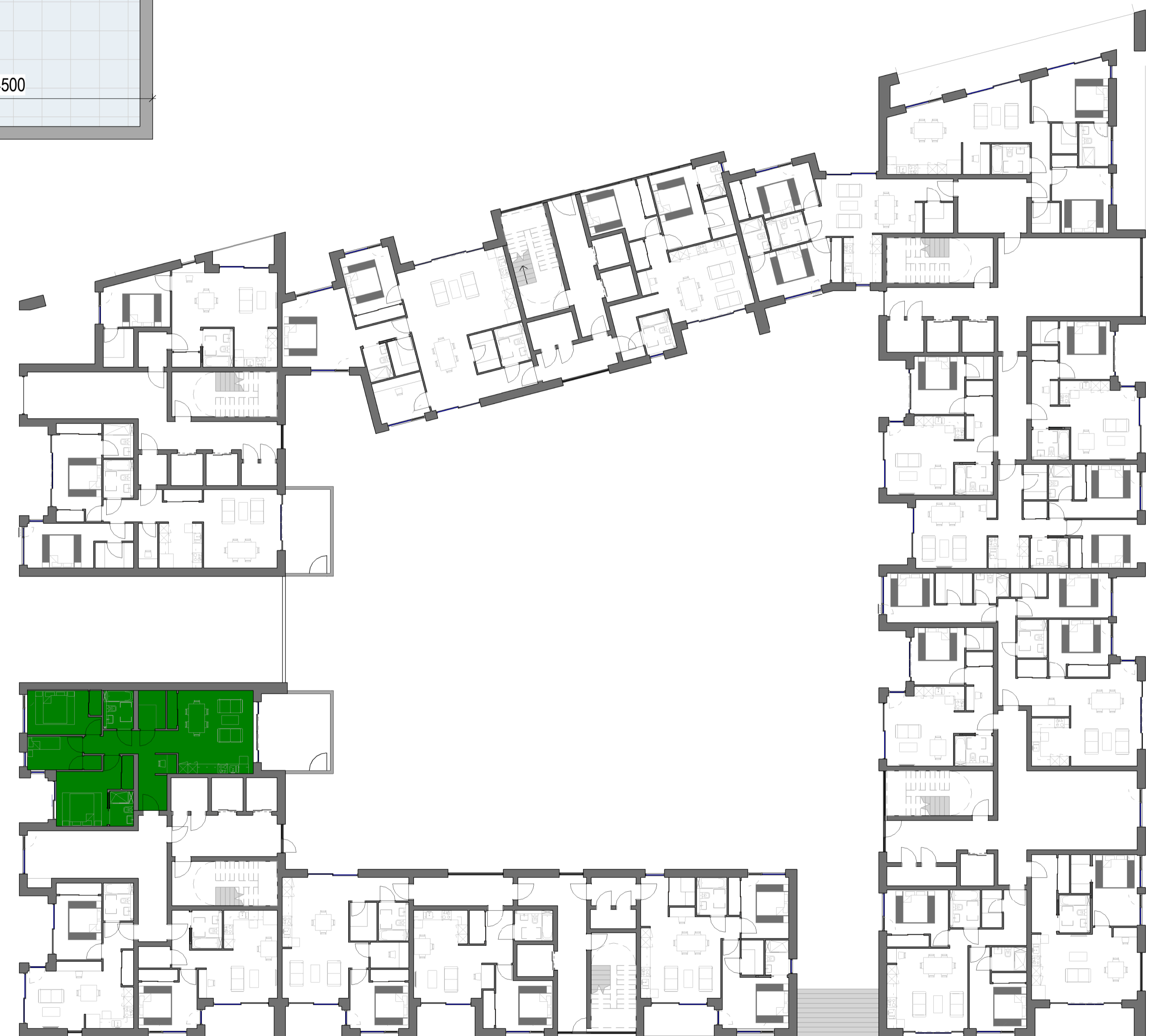
2 Block C_3 Bedroom Apartment Key Plan_Type 01 1 : 200