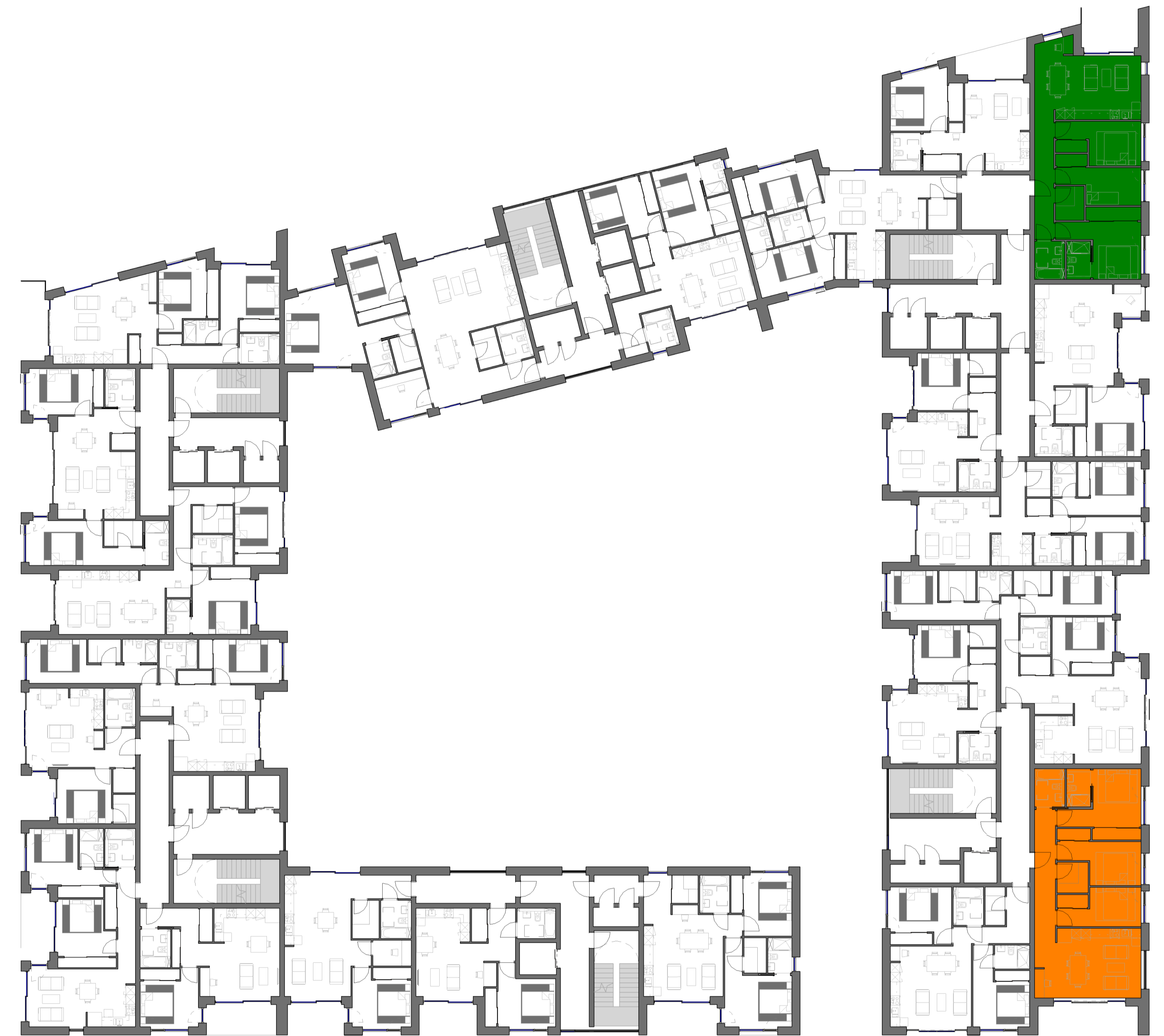
3 Block C_3 Bedroom Apartment Key Plan_Type 03 & 04 1 : 200