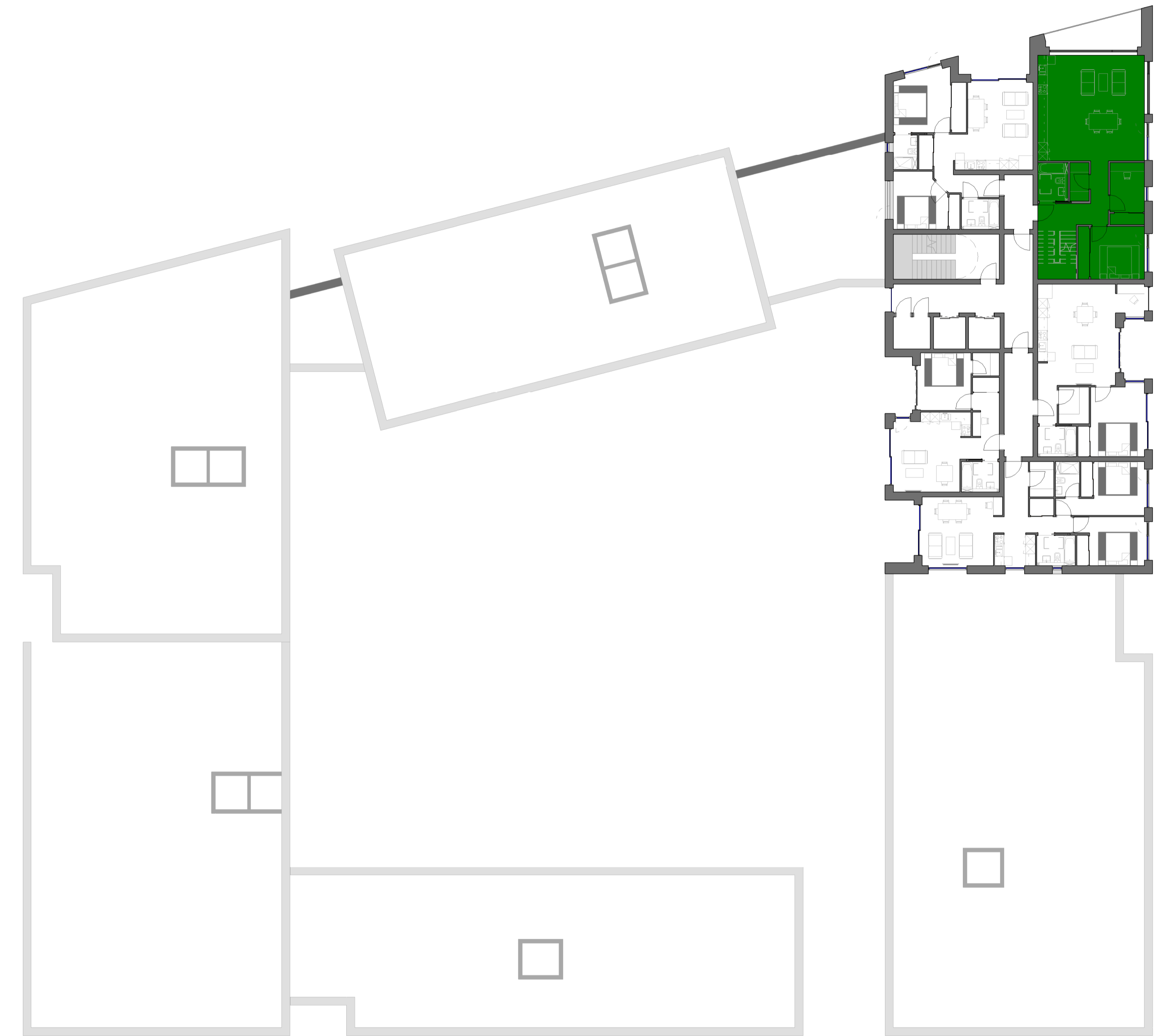
1 Block C_3 Bedroom Duplex Apartment Type 01 1 : 50

Lower Floor Size: 93.3m 2 Upper Floor Size: 67.8m 2 Total Size: 161.1m 2 Total Apartments: 1