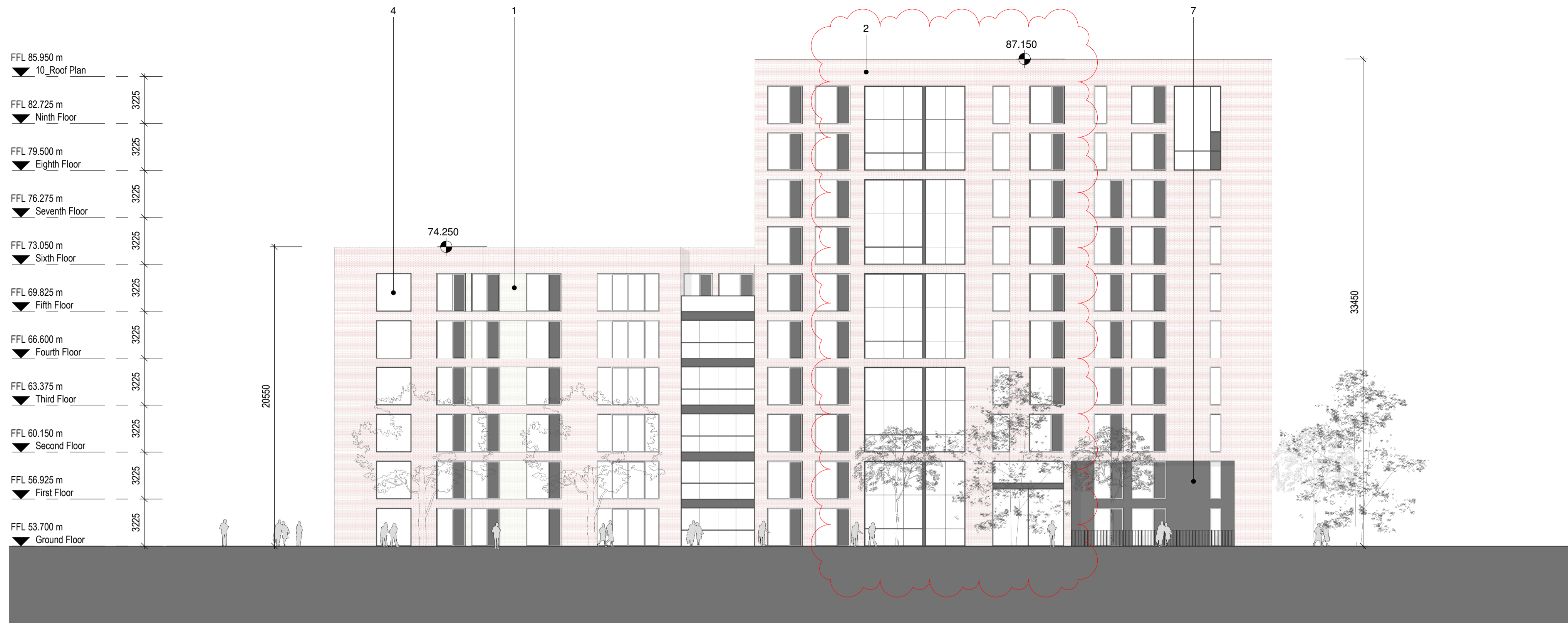
1 Block 1C_North Elevation 1 : 200