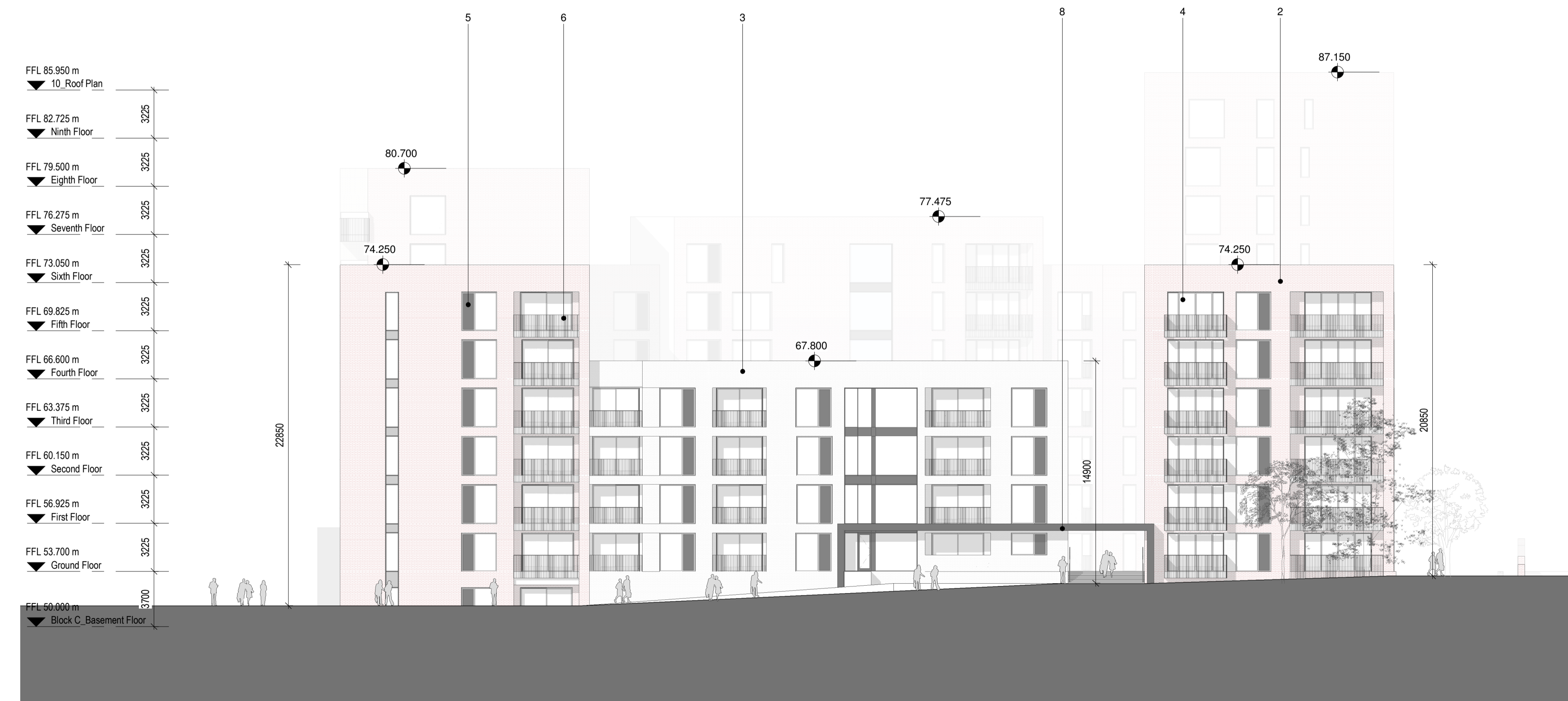
2 Block 1C_East Elevation 1 : 200