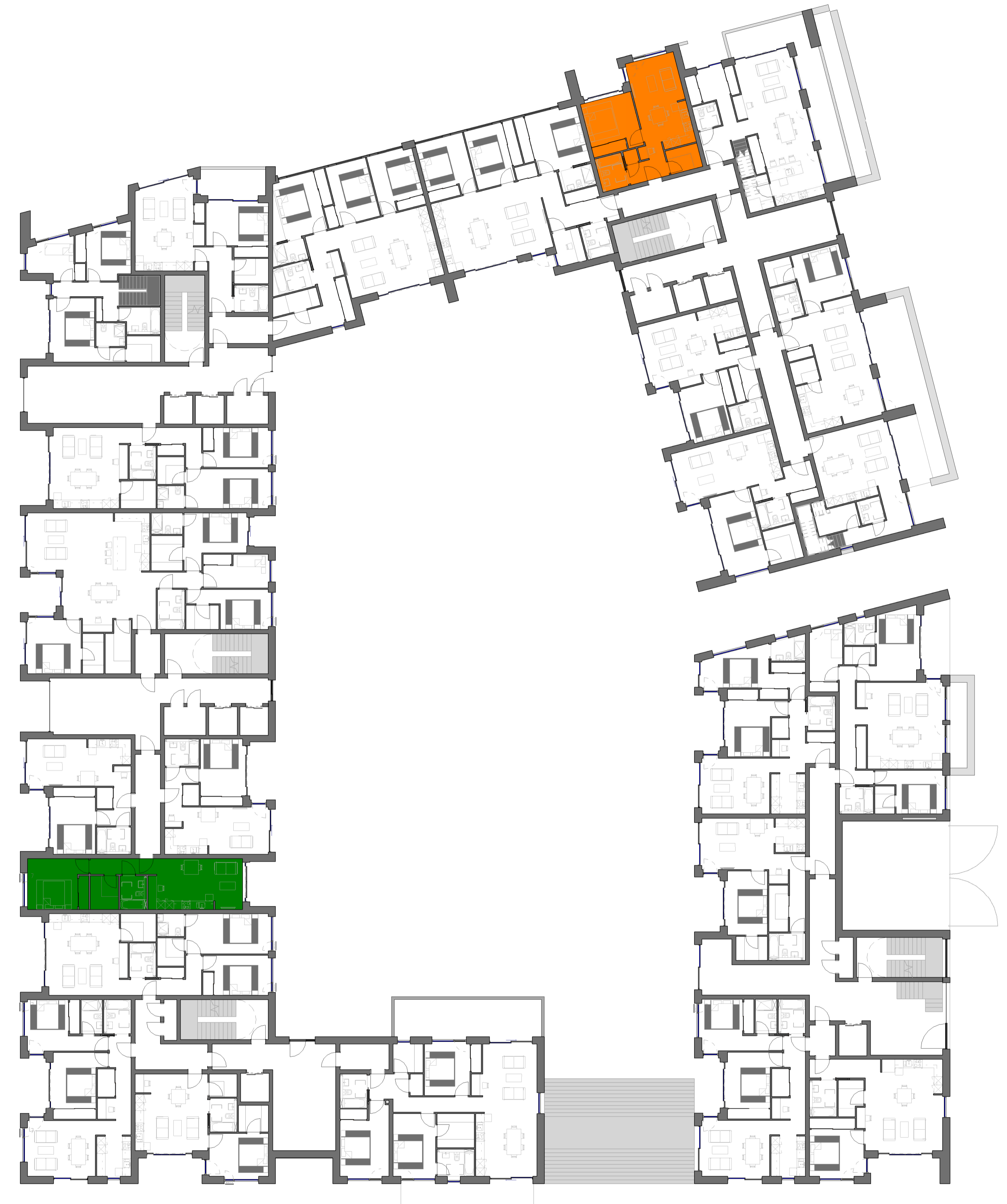
3 Block D_1 Bedroom Apartment Key Plan_Type 07 & 08 1 : 200