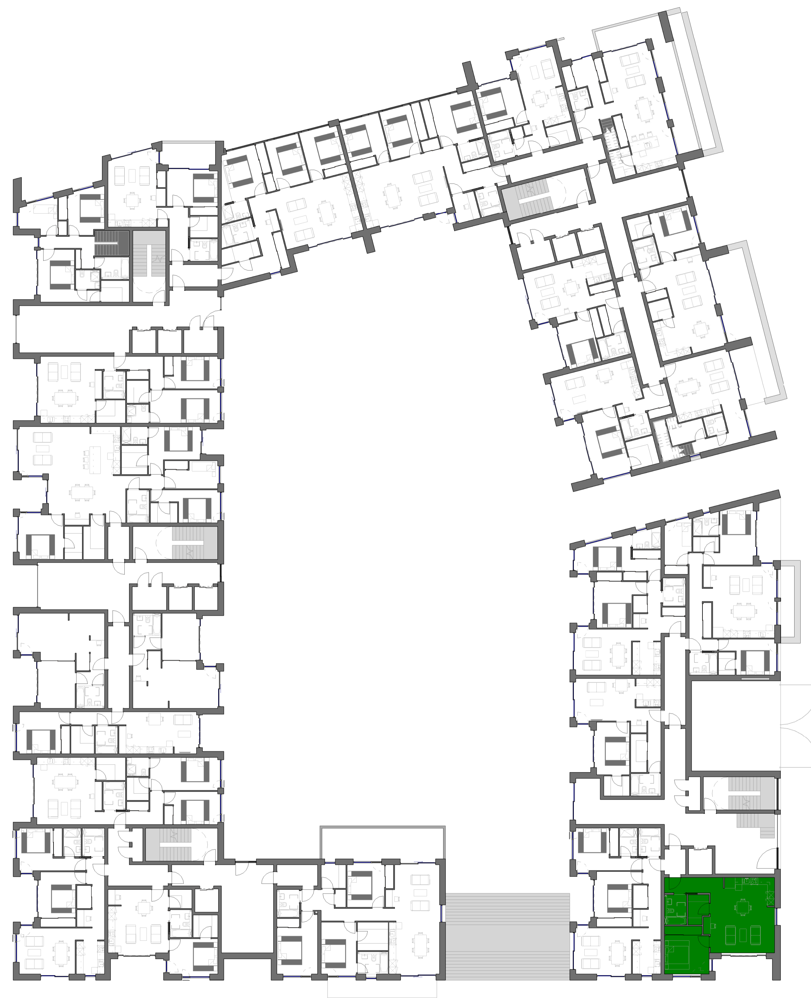
2 Block D_1 Bedroom Apartment Key Plan_Type 13 1 : 200