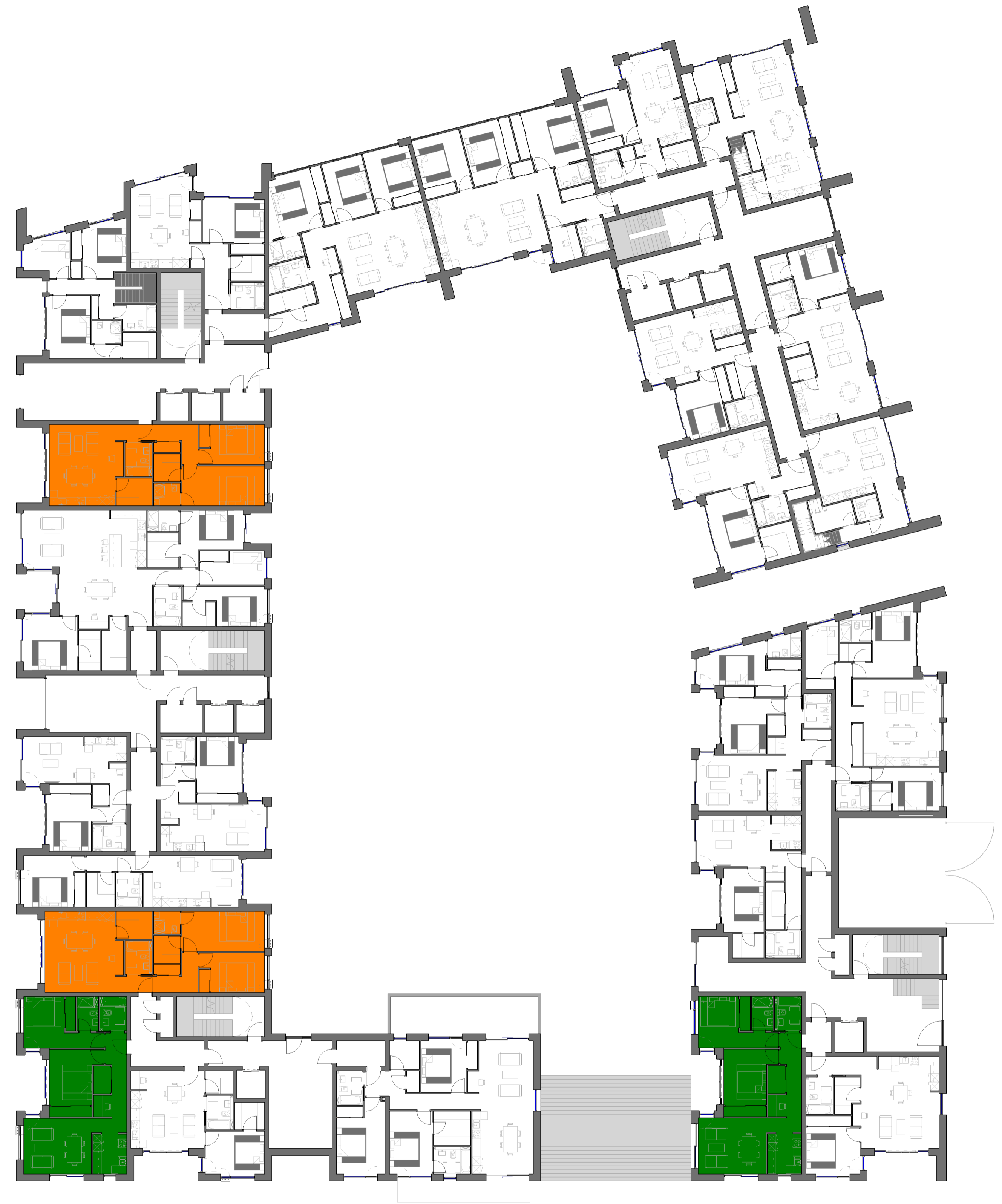
3 Block D_2 Bedroom Apartment Key Plan_Type 01 & 02 1 : 200