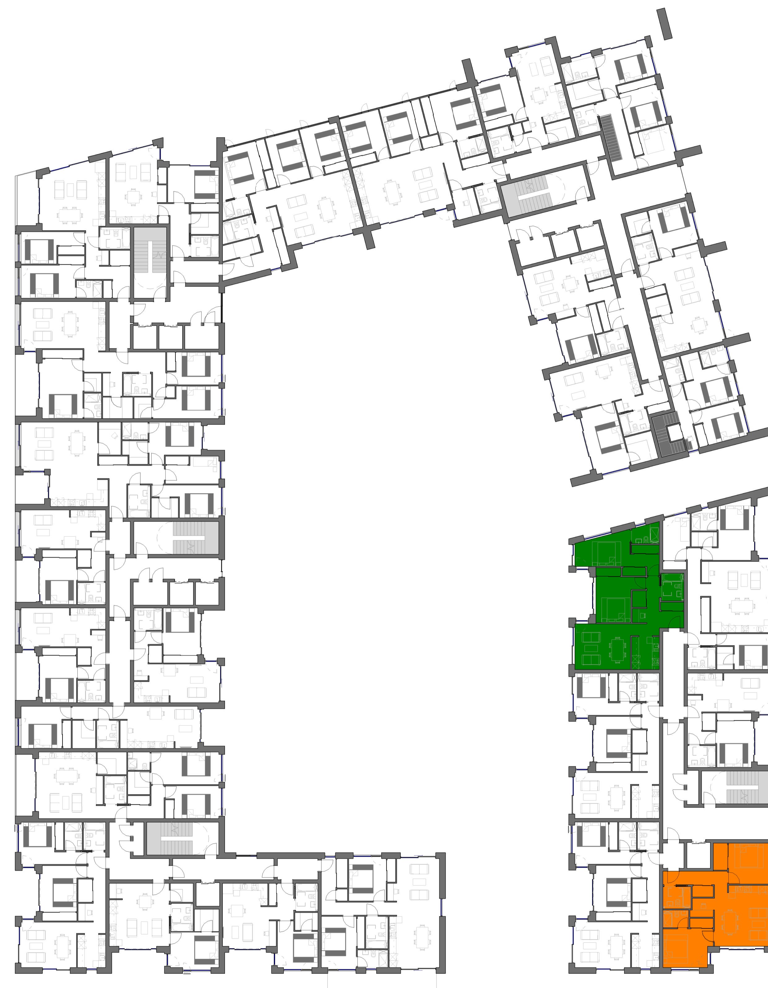
3 Block D_2 Bedroom Apartment Key Plan_Type 05 & 06 1 : 200