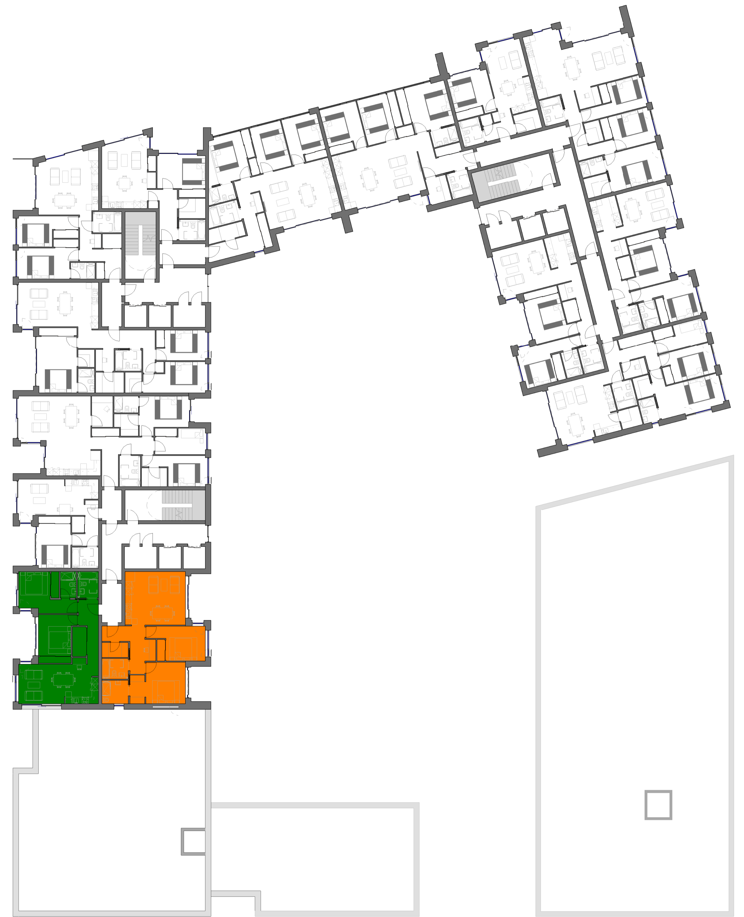
3 Block D_2 Bedroom Apartment Key Plan_Type 07 & 08 1 : 200