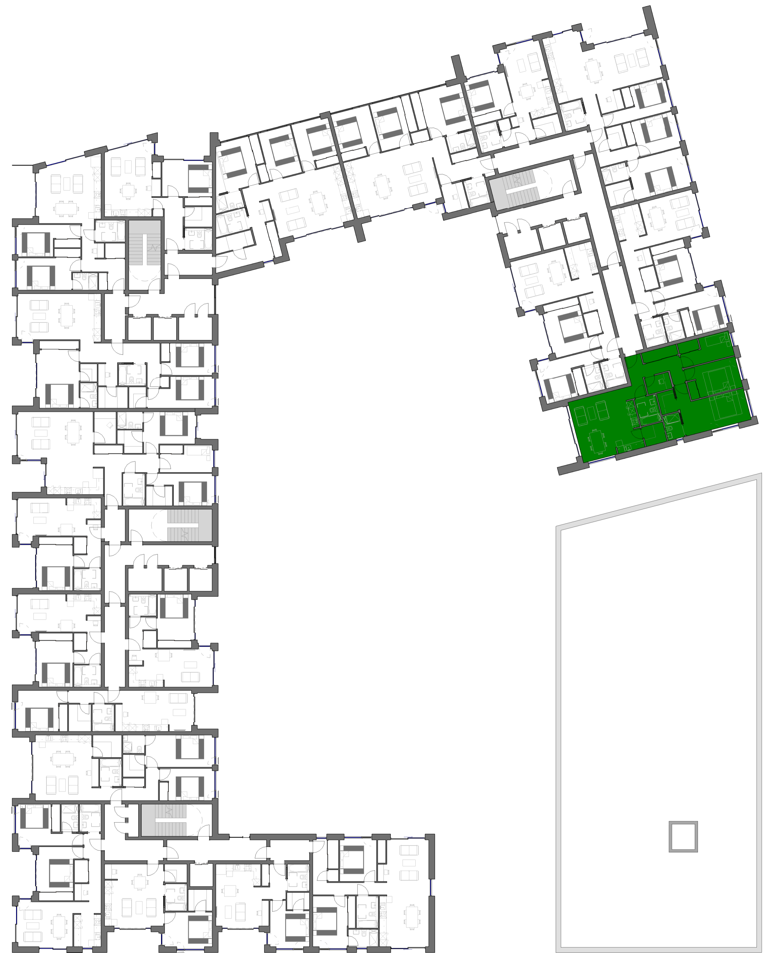
2 Block D_3 Bedroom Apartment Key Plan_Type 08 1 : 200