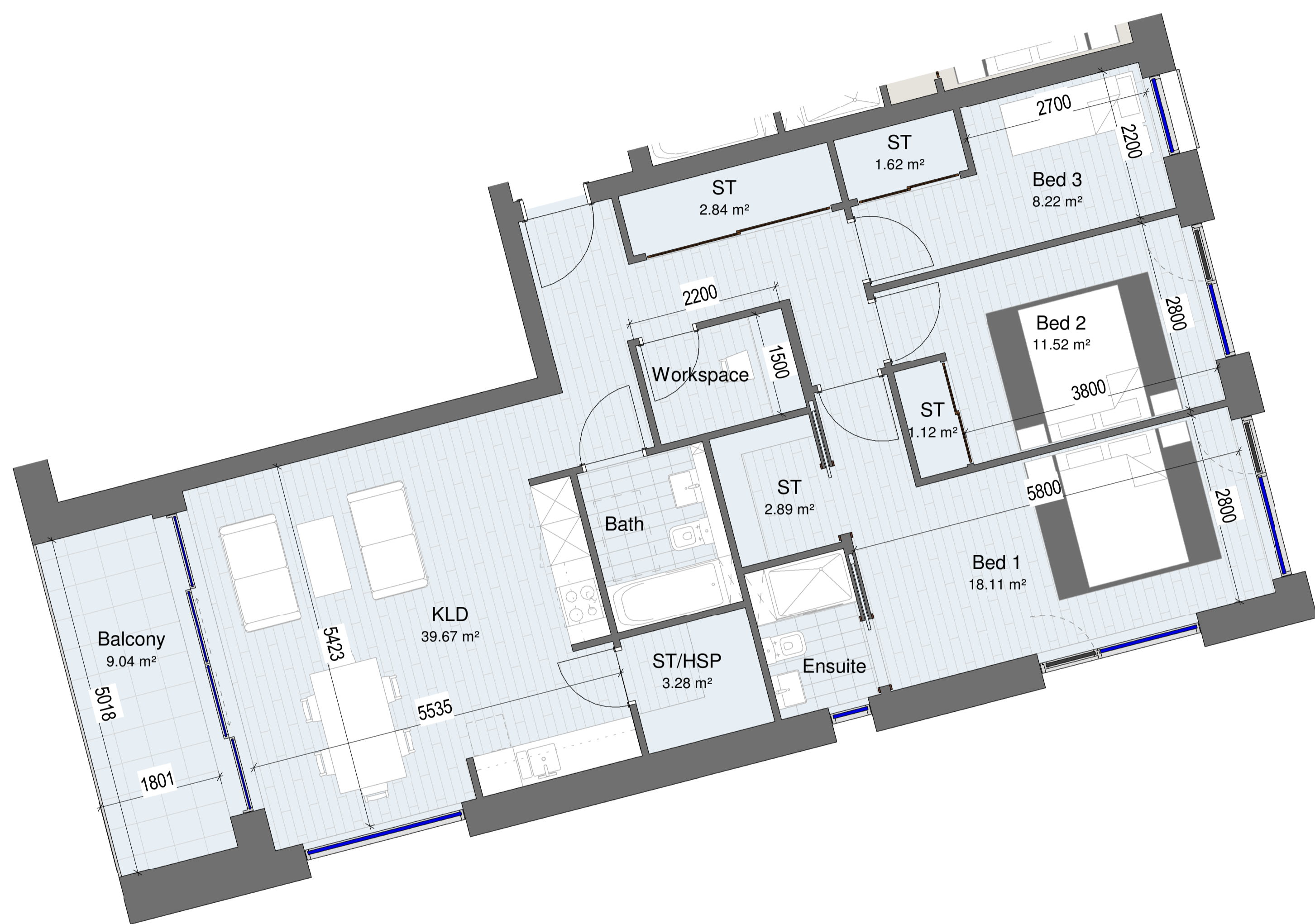
1 Block D_3 Bedroom Apartment Type 08 1 : 50 Size: 105.9m² Total Apartments: 5