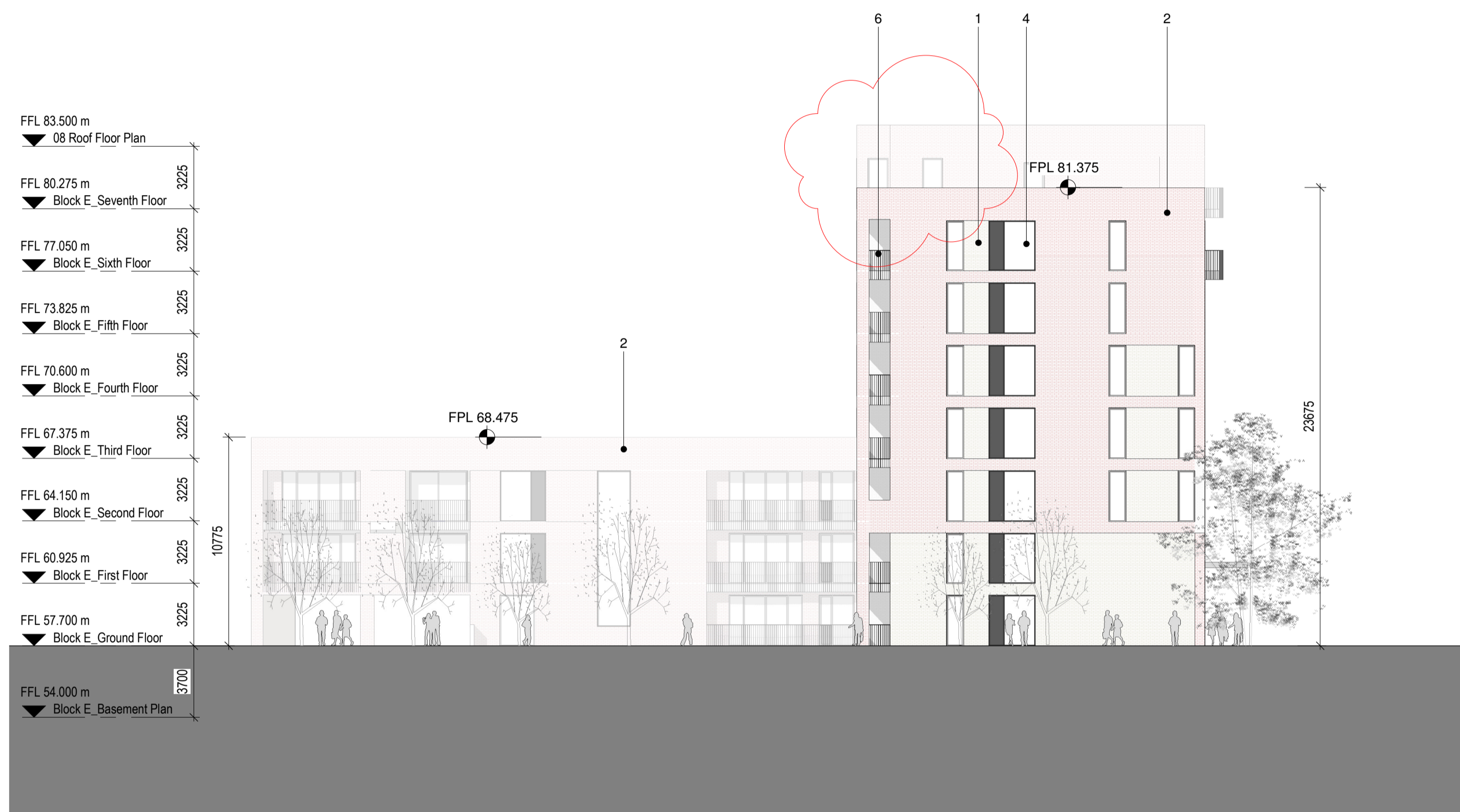
Block 1E_North Elevation