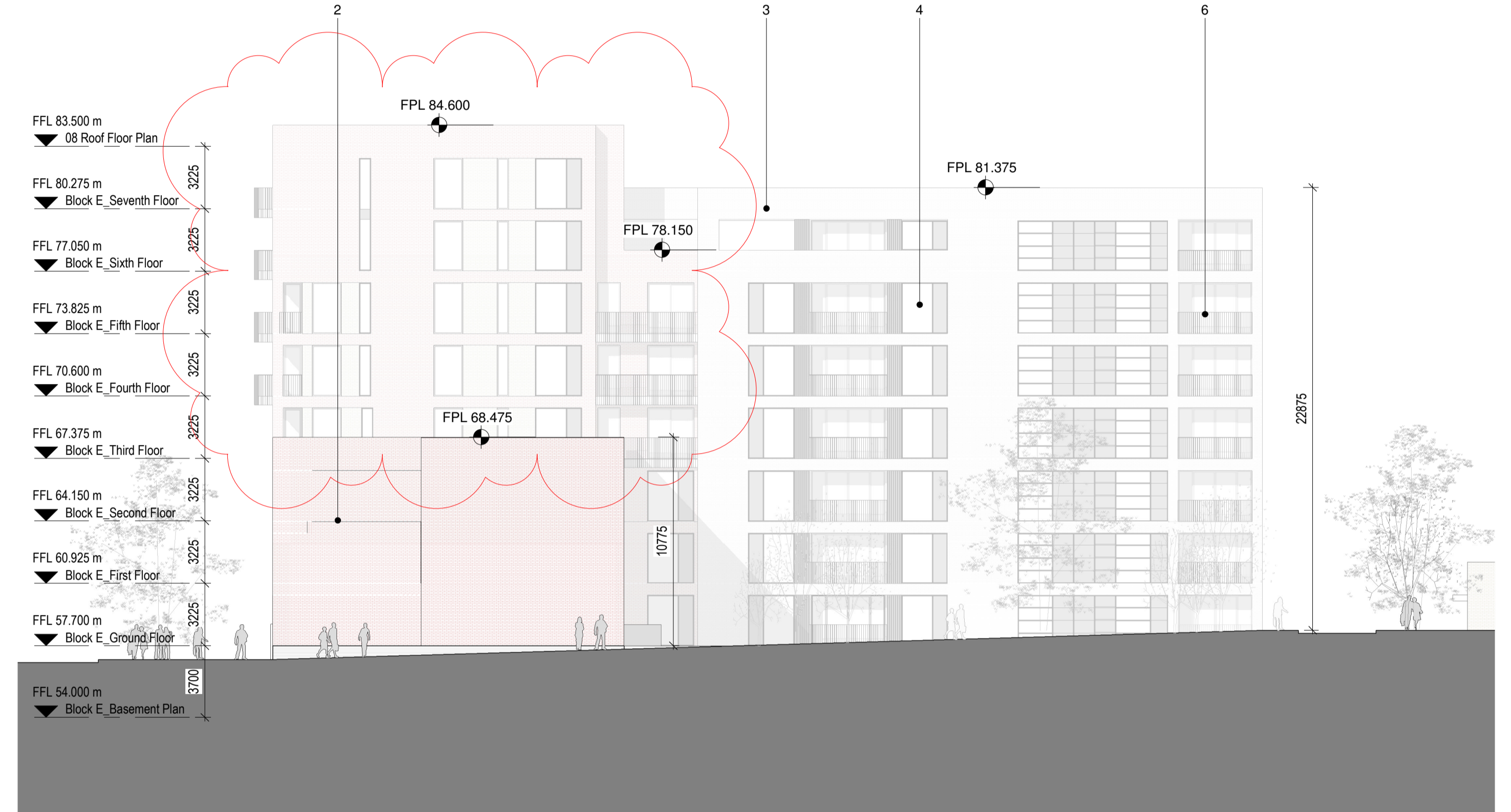
Block 1E_East Elevation