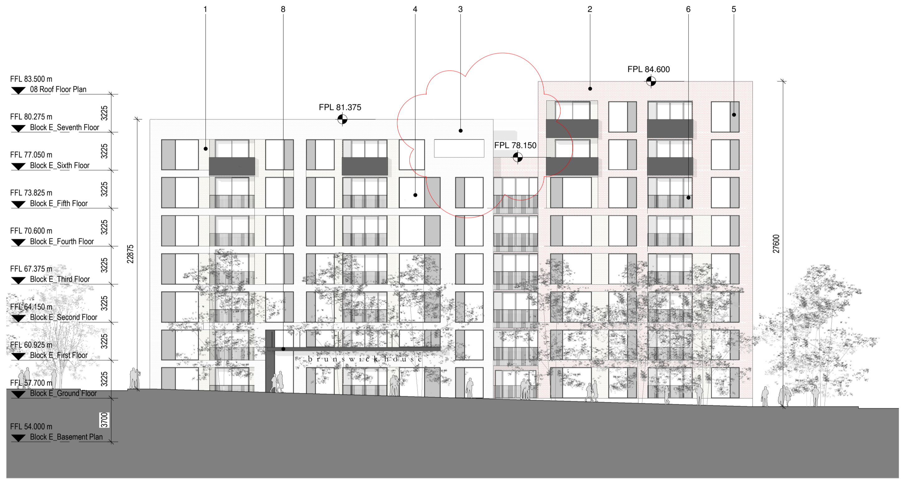
1 Block 1E_South Elevation 1 : 200