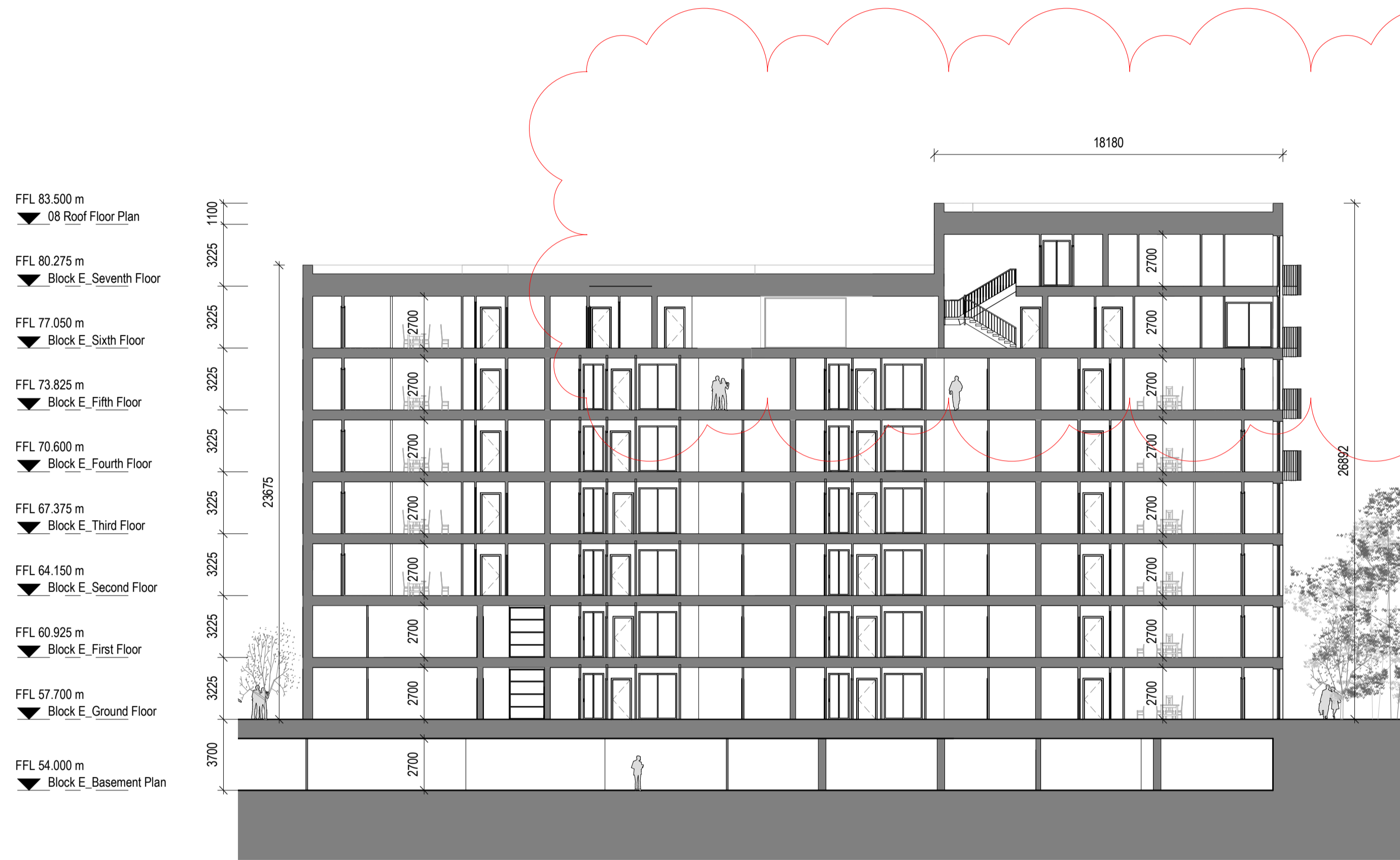
Block 1E_Cross Section A 1 : 200