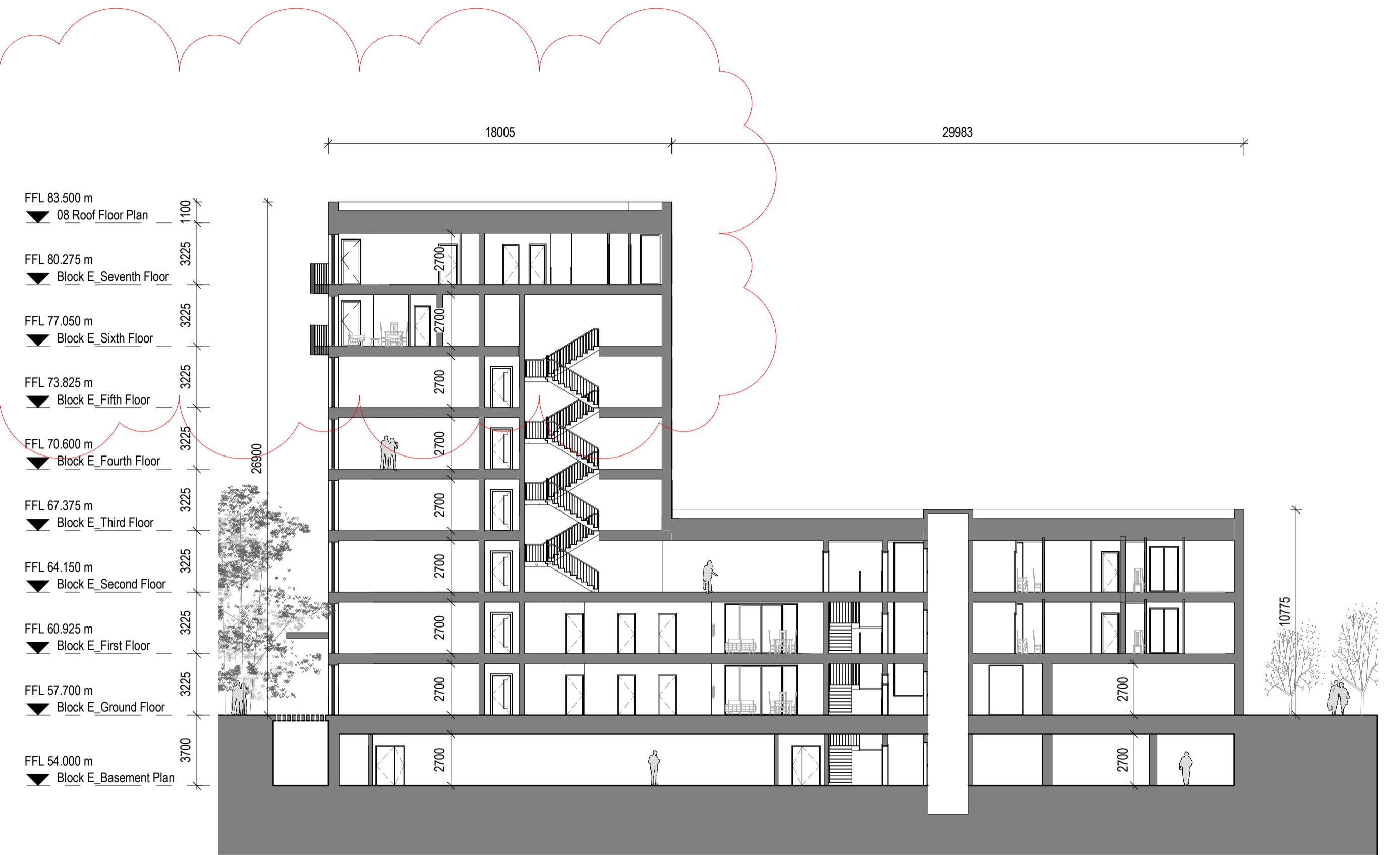
Block 1E_Cross Section B 1 : 200