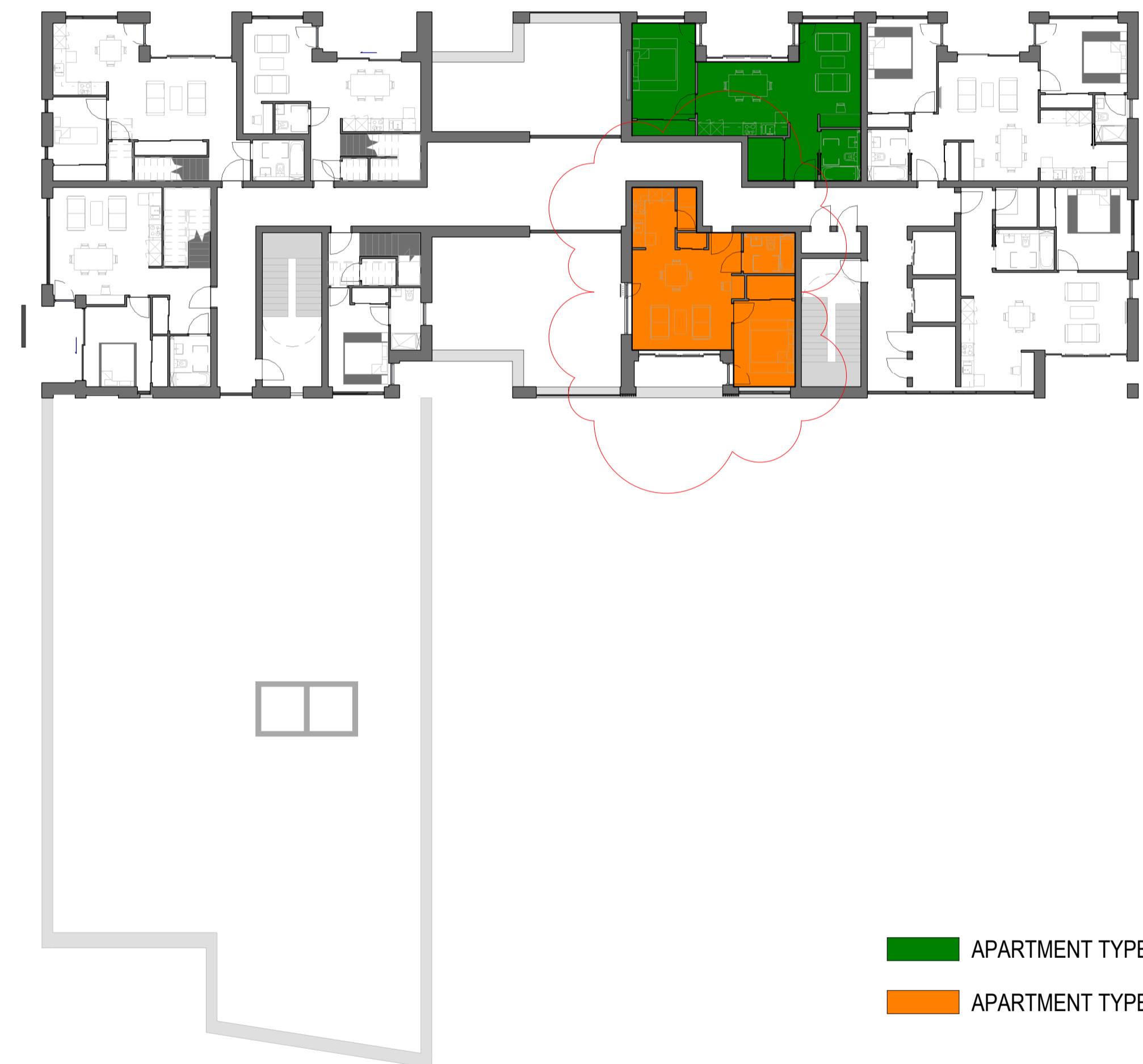
3 Block E_1 Bedroom Apartment Key Plan_Type 07 & 08 1 : 200