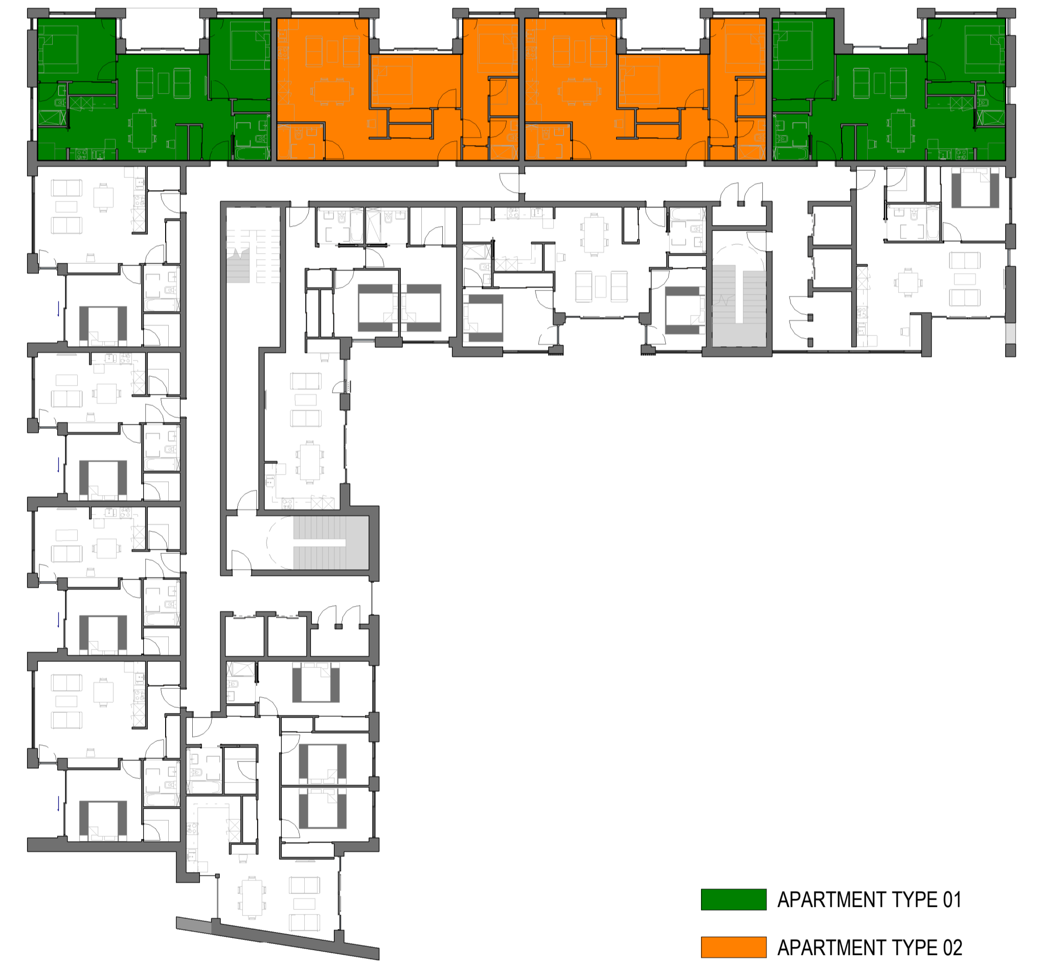
3 Block E_2 Bedroom Apartment Key Plan_Type 01 & 02 1 : 200