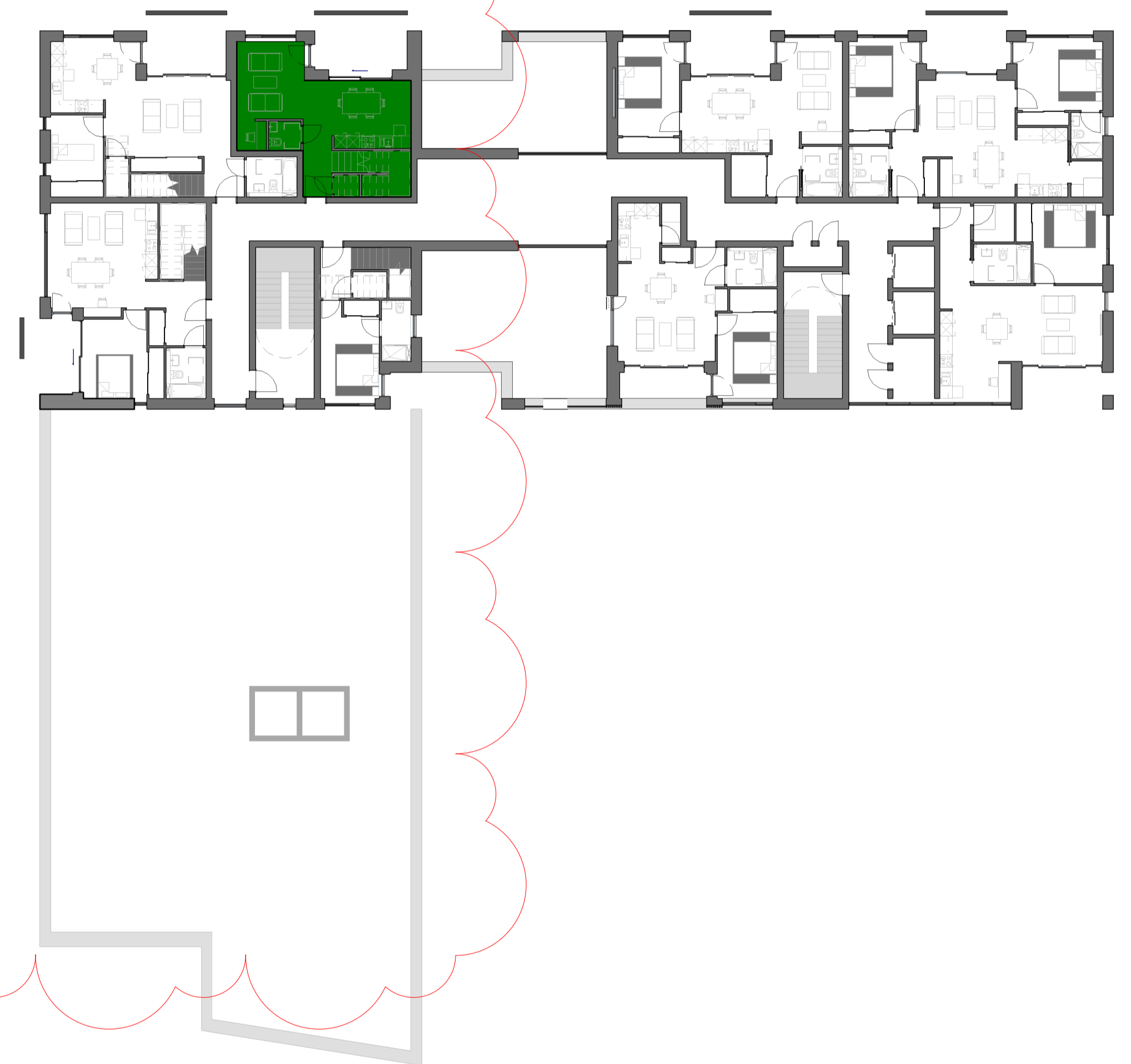
1 Block E_2 Bedroom Duplex Apartment type 02 1 : 50 Lower Floor Size: 44.7m 2 Upper Floor Size: 51.6m 2 Total Size: 96.3m 2 Total Apartments: 1