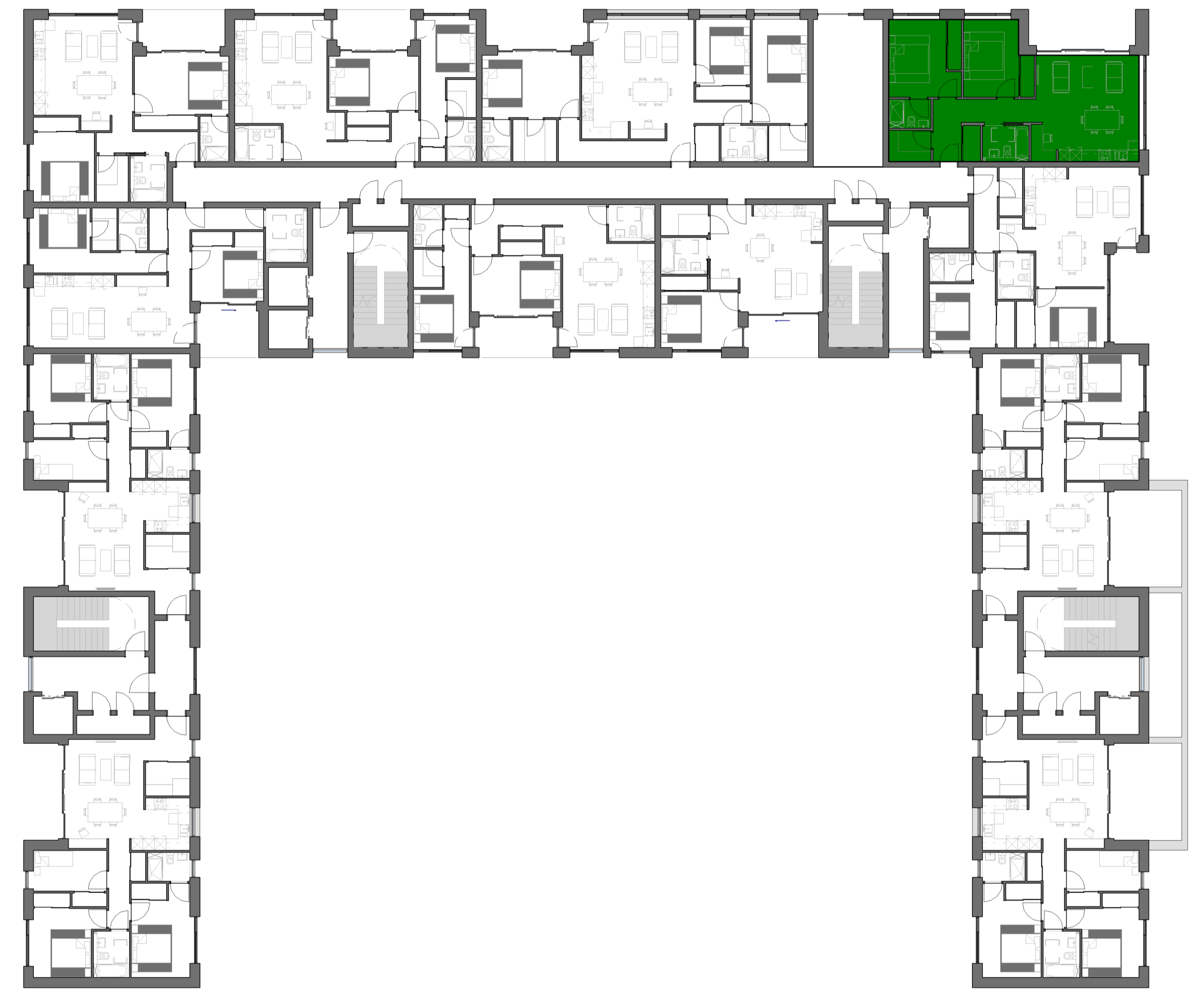
2 Block F_2 Bedroom Apartment Key Plan_Type 05 1 : 200