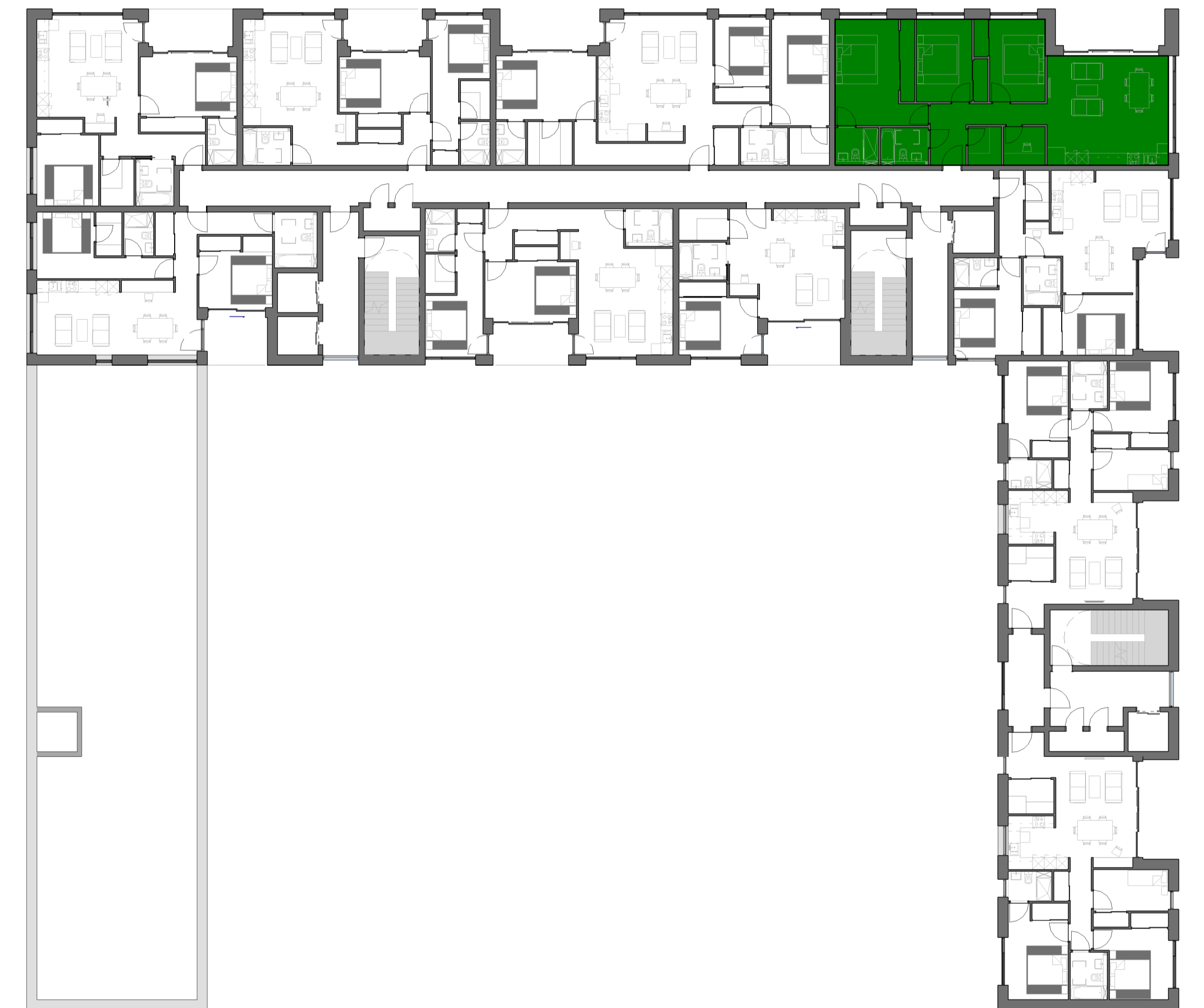
2 Block F_3 Bedroom Apartment Key Plan_Type 02 1 : 200