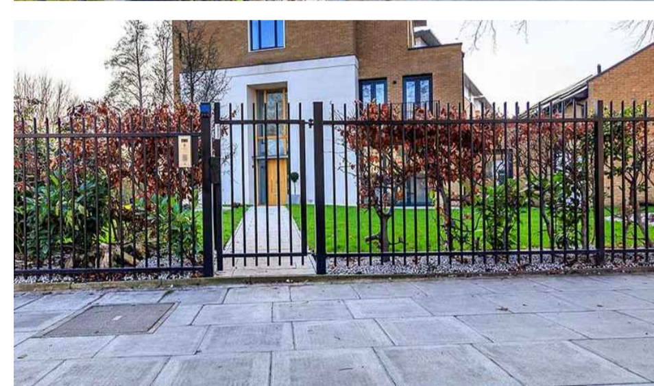
2 Courtyard Fences Nts Product: Barbican Imperial Manufacturer: Jacksons Fencing Height: 1.8m high Gate: Barbican Imperial 1.2m wide pedestrian Barbican Imperial 4.5m wide emergency vehicle gate