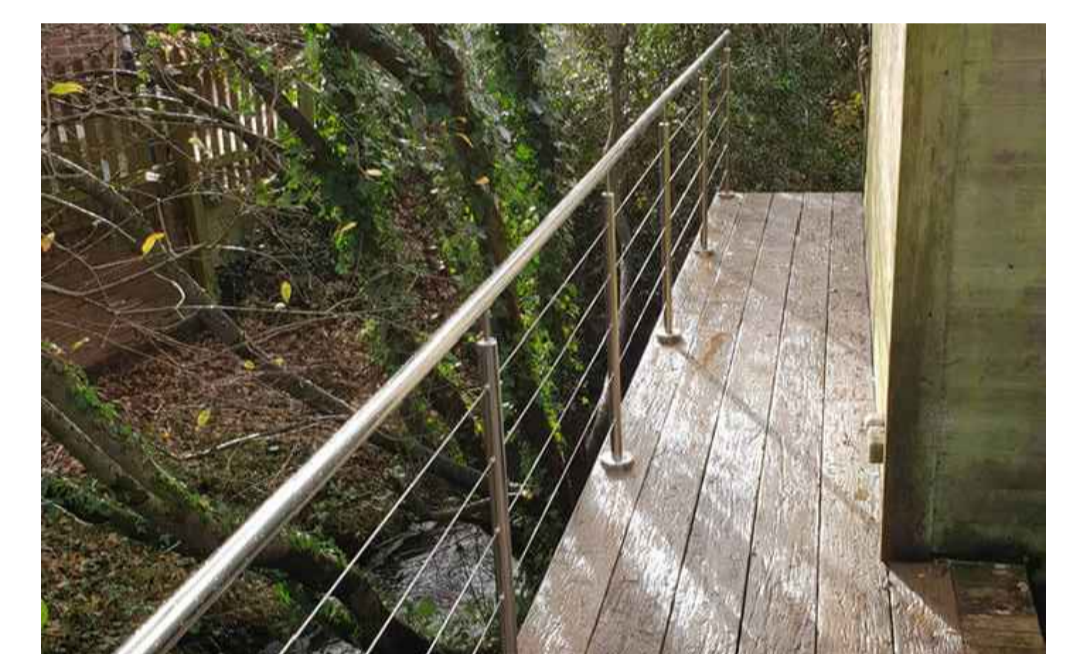
4 Pond Deck Fence Nts Product: Wire Rope Balustrade Manufacturer: SHS Balustrades and Glass Height: 1.1m high Gate: not required