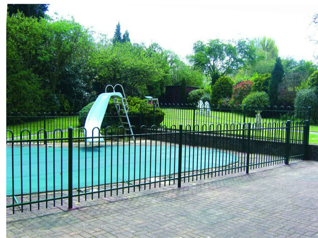
5 Play Areas Boundary Fence Nts Product: Tubular Bow Top Railings Manufacturer: Jacksons Fencing Height: 1.2m high Gate: 1.2m wide single leaf gates