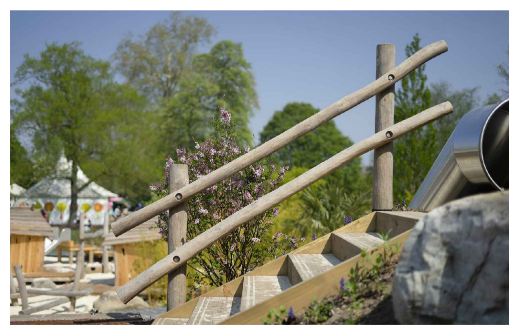
6 Handrails within play areas Nts Product: Playground Handrails HR101 Manufacturer: Duncan & Grove Height: 0.7m high Gate: not required