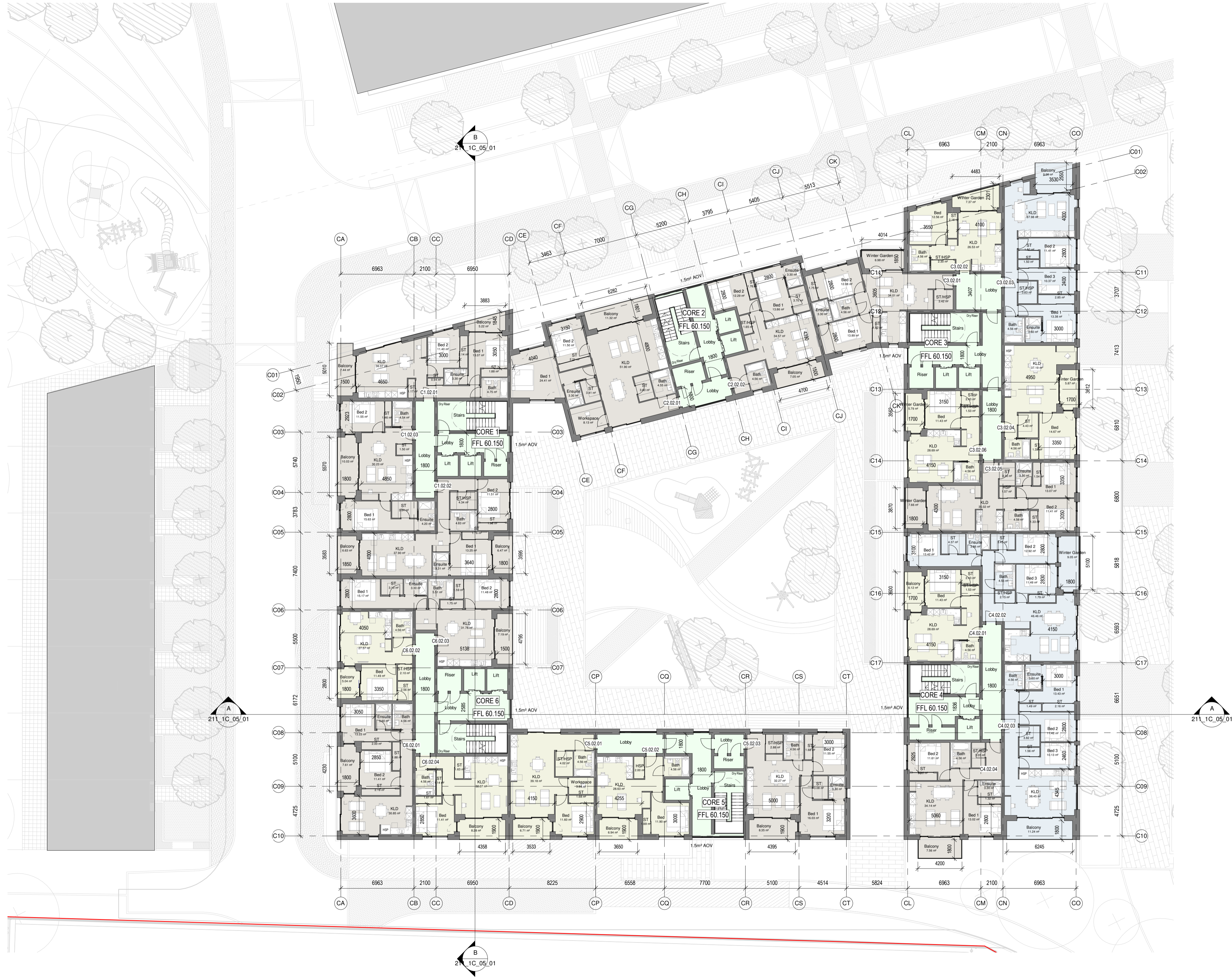
1 Block 1C_Second Floor Plan 1 : 200